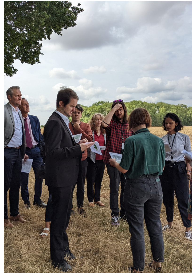
Panel site visit

From time to time, it may be of benefit for specialist advice to be provided beyond the Quality Review Panel membership. In such cases, a professional with the relevant expertise may be invited to attend a review meeting, participating in the discussion with the status of an adviser to the panel.