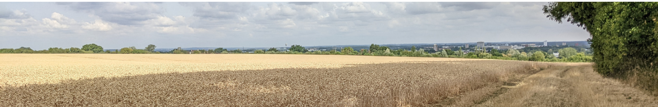
A view of Harlow town centre from Latton Priory masterplan site

Large projects, for example schemes with several development plots, may be split into smaller elements for the purposes of review to ensure that each component receives adequate time for discussion.