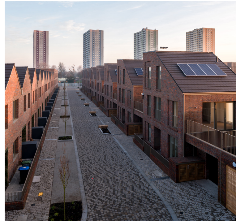
Dujardin Mews, Maccreanor Lavington and Karakusevic Carson Architects Civic Trust Award 2018 - RIBA National Award 2017

As public authorities the Councils are subject to the Freedom of Information Act 2000 (the Act). All requests made to the Councils (Harlow Council, Epping Forest District Council and East Herts District Council) for information with regard to the Harlow and Gilston Quality Review Panel will be handled according to the provisions of the Act. Legal advice may be required on a case by case basis to establish whether any exemptions apply under the Act.