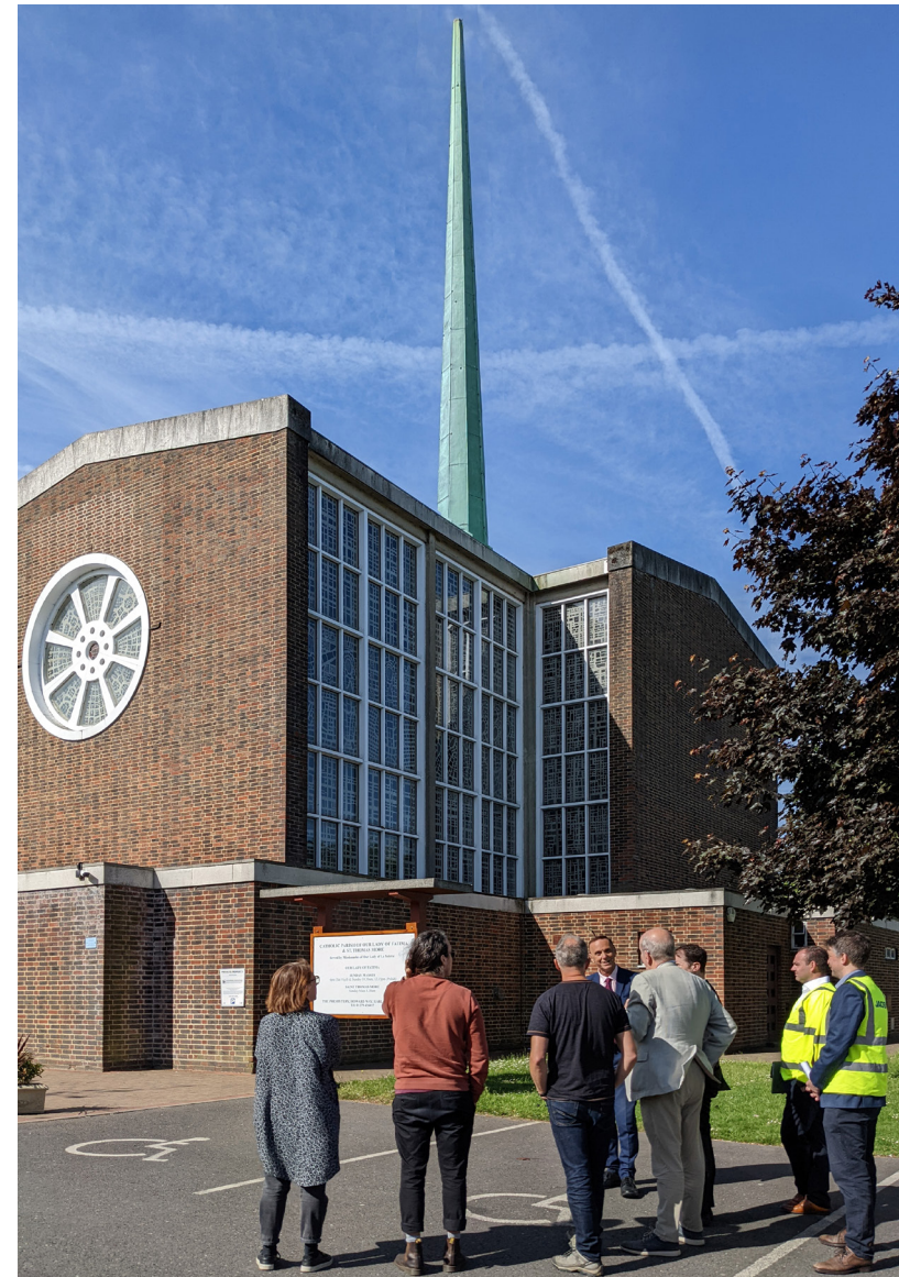
Our Lady Of Fatima Church