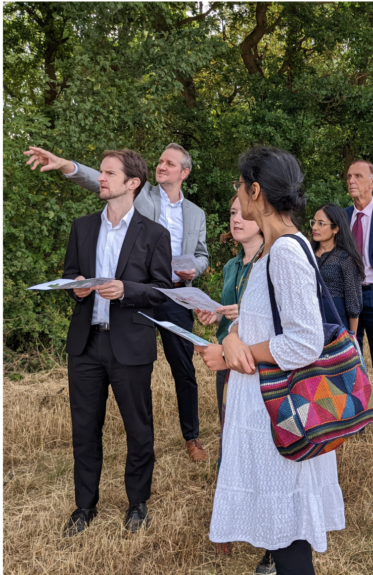
Panel site visit