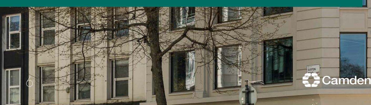
Image: 373 Euston Road - Birkbeck exterior, Penoyre & Prasad