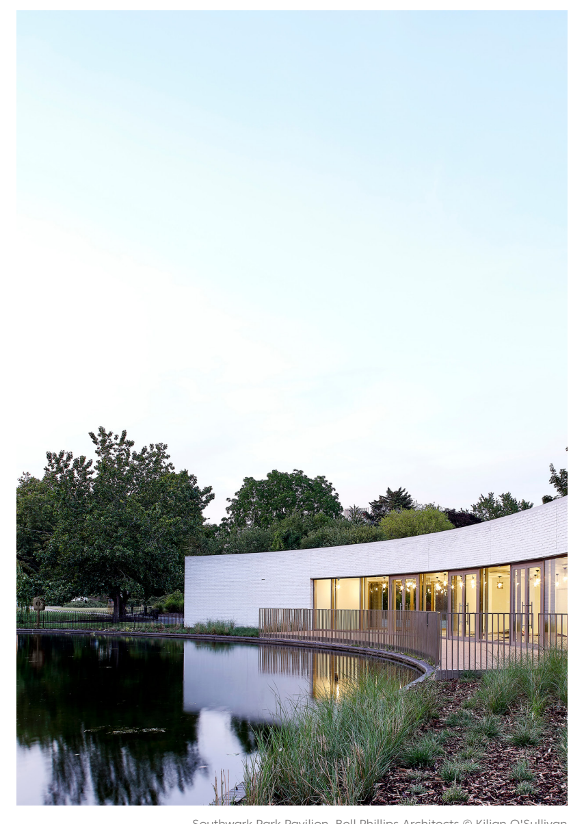
Southwark Park Pavilion, Bell Phillips Architects

https://www.london.gov.uk/sites/default/files/the_london_plan_2021. pdf