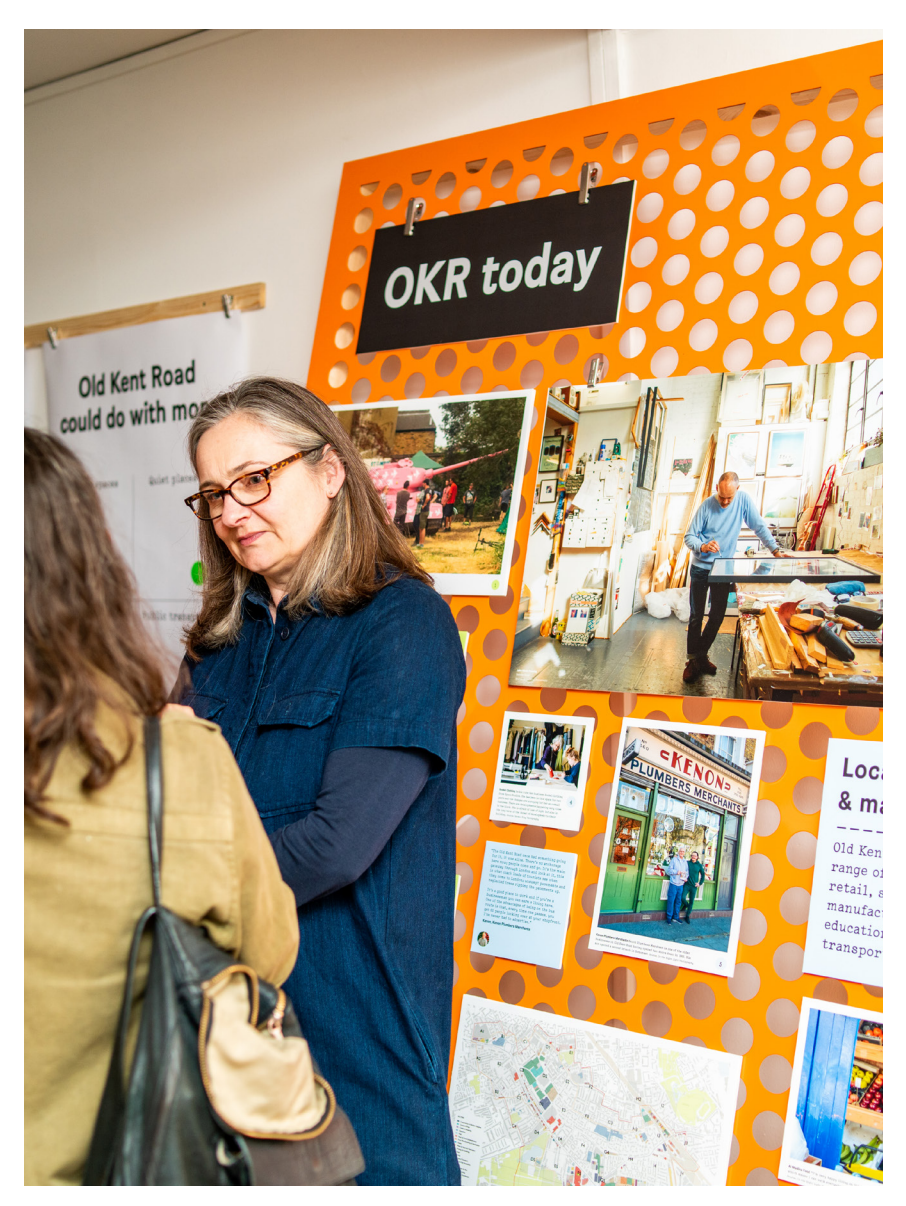
Launch of 231 Old Kent Road

If you would like a summary of this Handbook in your language, please contact tom@frame-projects.co.uk.