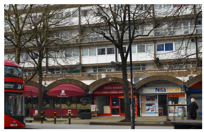
Old Kent Road

If any comments made by the Community Review Panel require clarification, it is the responsibility of the presenting team, whether project promoters or Southwark officers, to draw this to the attention of the panel chair (if during the meeting) or the panel manager at Frame Projects (if the report of the meeting requires clarification).