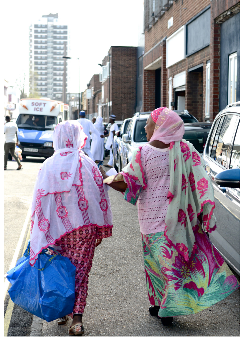
Ormside Street

Where a project returns for a second or subsequent review, the report of the previous review will be provided with the agenda.