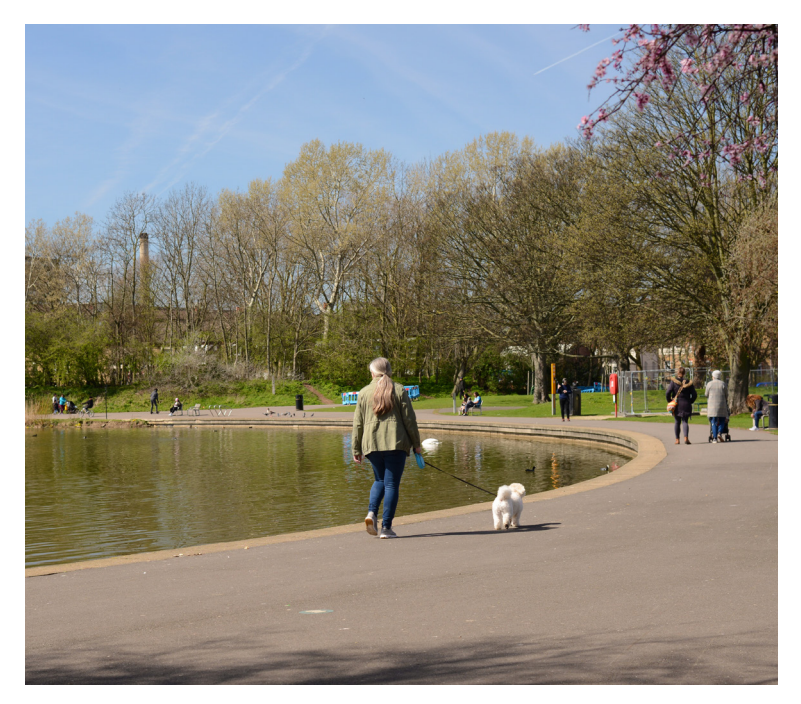
Burgess Park

As a public authority, Southwark Council is subject to the Freedom of Information Act 2000 (the Act). All requests made to the Council for information, with regard to the Community Review Panel, will be handled according to the provisions of the Act. Legal advice may be required on a case by case basis to establish whether any exemptions apply under the Act.