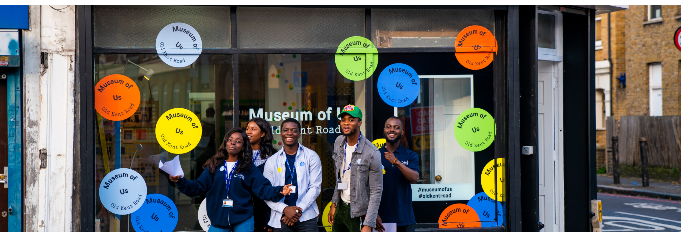
Old Kent Road opening

Community Review Panel members are entitled to claim reasonable expenses for travel to review meetings, and for other costs incurred in order to attend meetings. Frame Projects will provide an expense form which should be completed and sent to the Community Review Panel manager, with receipts or other evidence of expenditure, before the date of the next panel meeting.