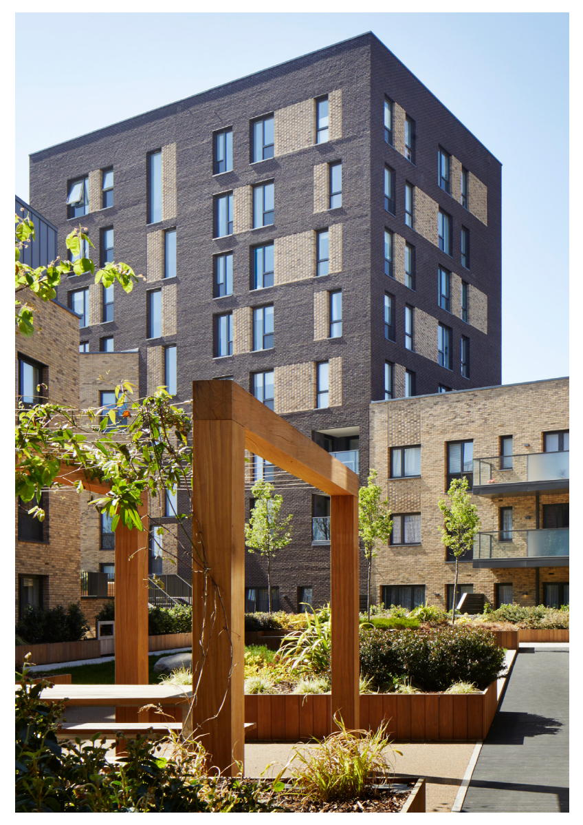
Peckham Place, Jestico + Whiles