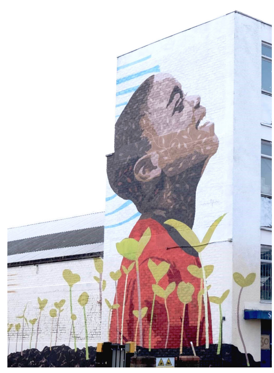
Berkeley Mural