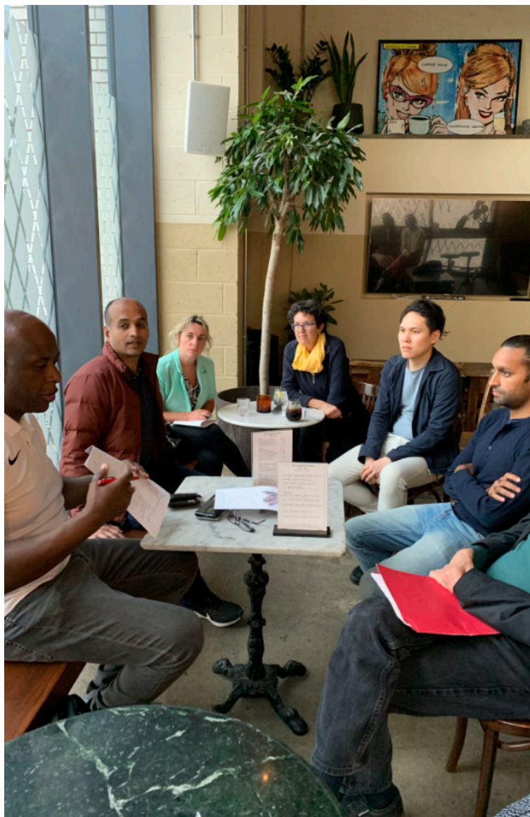
Community Review Panel meeting