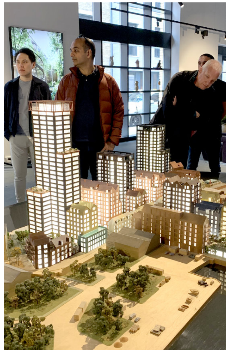
Community Review Panel meeting

If any comments made by the Community Development Panel require clarification, it is the responsibility of the presenting team, whether project promoters or LB Tower Hamlets officers, to draw this to the attention of the group chair (if during the meeting) or the group manager at Frame Projects (if the report of the meeting requires clarification).