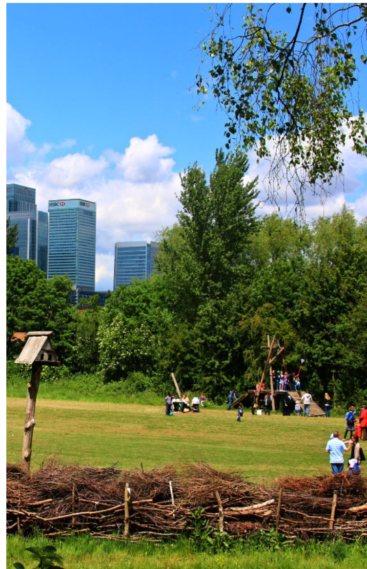
Mudchute Park

Where a project returns for a second or subsequent review, the report of the previous review will be provided with the agenda.