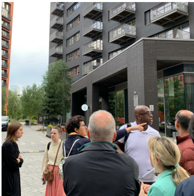
Site visit

IoD&SP Community Development Panel members are entitled to claim reasonable expenses for travel to review meetings and site visits, and for other costs incurred in order to attend meetings. Frame Projects will provide an expense form which should be completed and sent to the Community Development Panel Manager with receipts or other evidence of expenditure, before the date of the next group meeting.