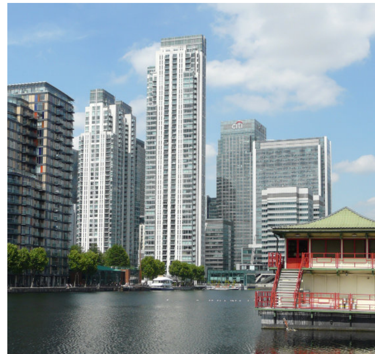
Millwall Inner Dock

As a public authority, LB Tower Hamlets is subject to the Freedom of Information Act 2000 (the Act). All requests made to LB Tower Hamlets information with regard to the IoD&SP Community Development Panel will be handled according to the provisions of the Act. Legal advice may be required on a case-by-case basis to establish whether any exemptions apply under the Act.