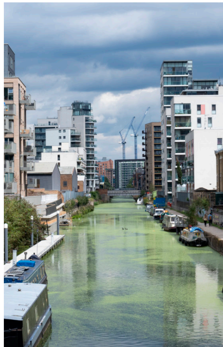
Limehouse Cut

Membership of the panel is reviewed each year, so that panel members have the opportunity to decide if they want to carry on being involved, and LB Tower Hamlets can assess whether the group is performing its intended role effectively.