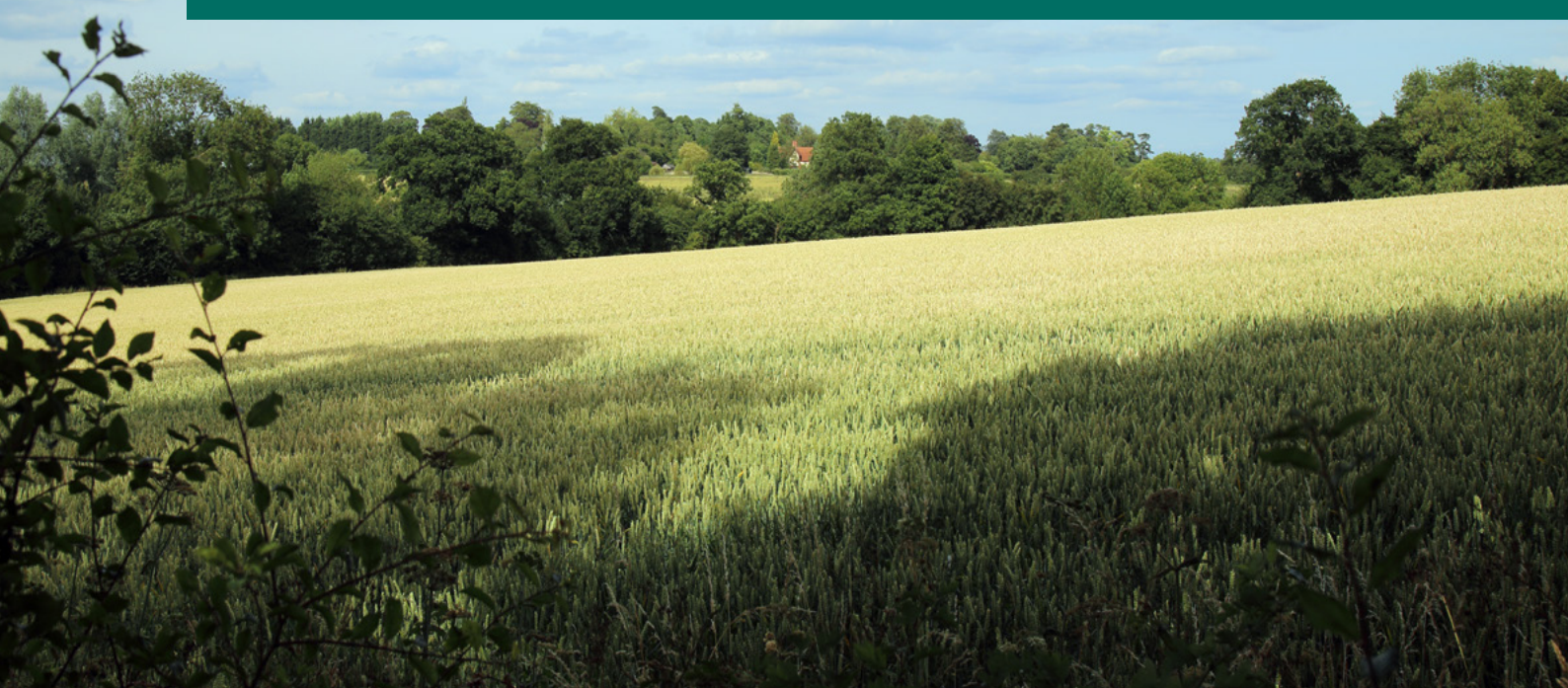
Image: A view East from Gibberd Garden, Essex

Frame Projects also ran a climate emergency training session for panel members and planning officers in April 2021. This was developed in collaboration with Architects Declare and the London Energy Transformation Initiative (LETI). As an output of this session, the guidance notes sent to presenting teams in advance of a review are being updated, to give more clarity about the information required.