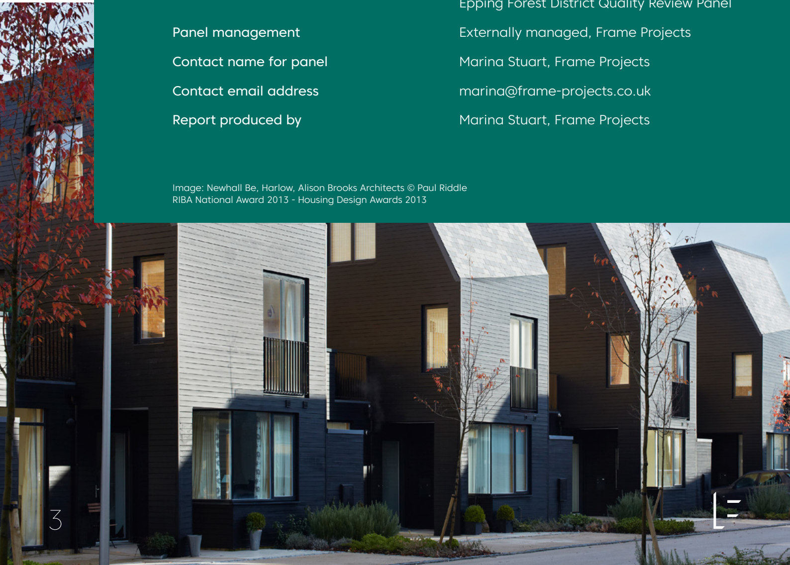
Image: Newhall Be, Harlow, Alison Brooks Architects RIBA National Award 2013 - Housing Design Awards 2013