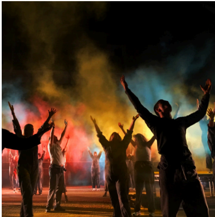
London Borough of Culture 2020 opening ceremony

Brent Community Review Panel members are entitled to claim reasonable expenses for travel to review meetings and site visits, and for other costs incurred in order to attend meetings. Frame Projects will provide an expense form which should be completed and sent to the Community Review Panel Manager with receipts or other evidence of expenditure, before the date of the next panel meeting.