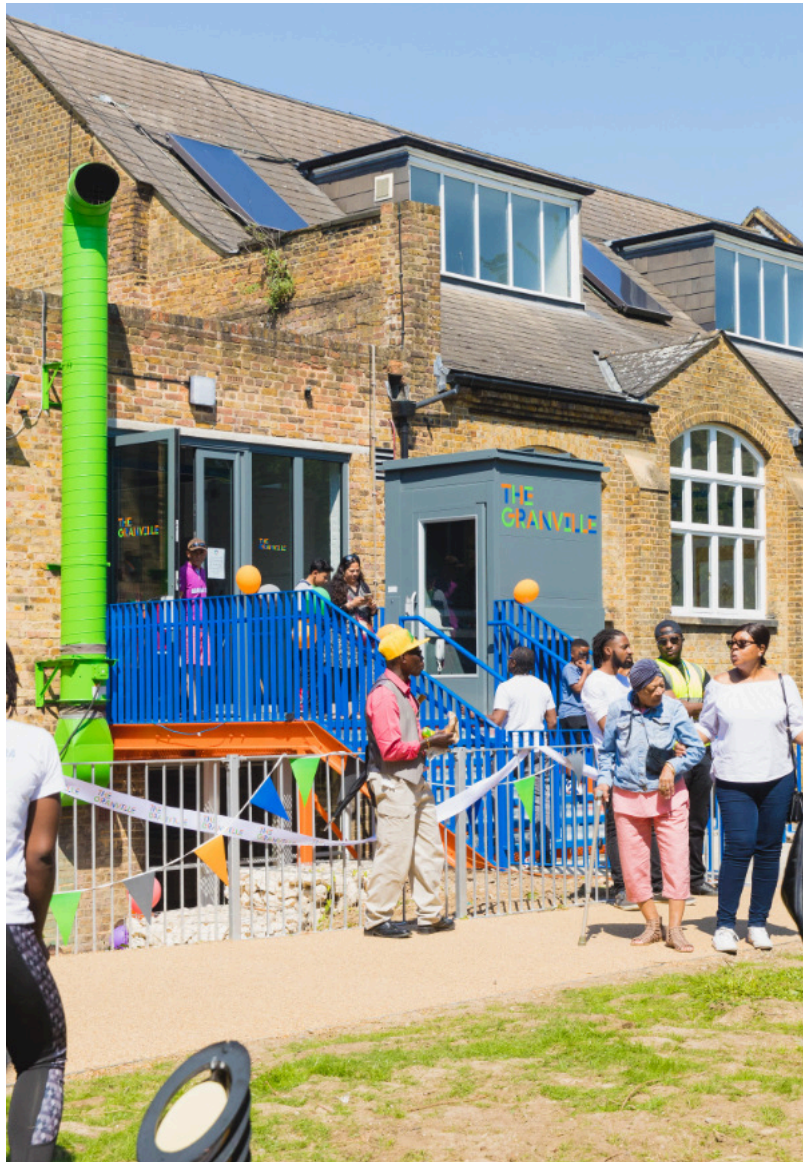
The Granville, RCKa © Jakob Spriestersbach & Kit Oates