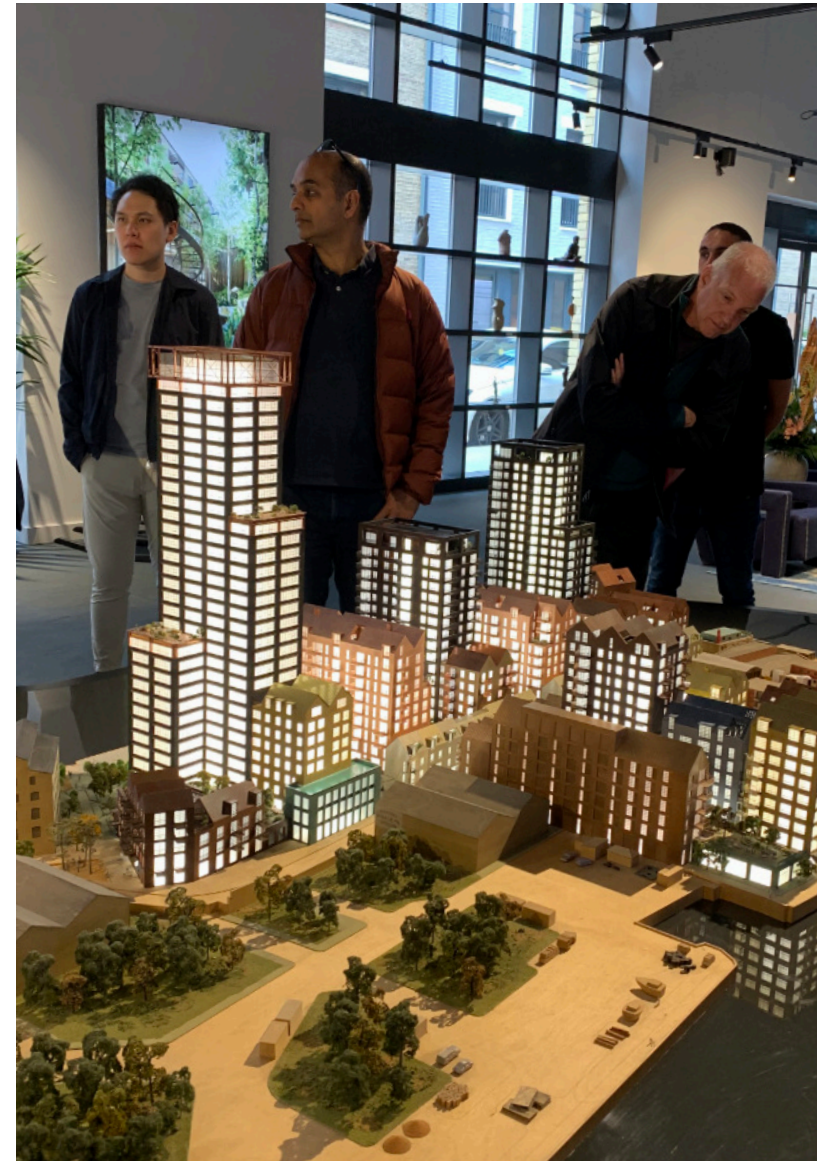
Community review meeting

Where a project returns for a second or subsequent review, the report of the previous review will be provided with the agenda.