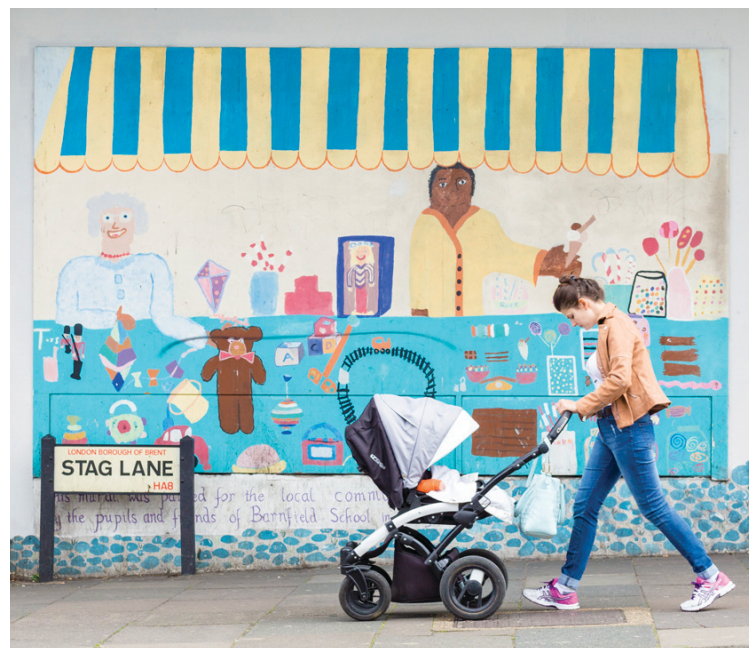
Burnt Oak Town Centre

As a public authority, Brent Council is subject to the Freedom of Information Act 2000 (the Act). All requests made to Brent Council information with regard to the Brent Community Review Panel will be handled according to the provisions of the Act. Legal advice may be required on a case-by-case basis to establish whether any exemptions apply under the Act.