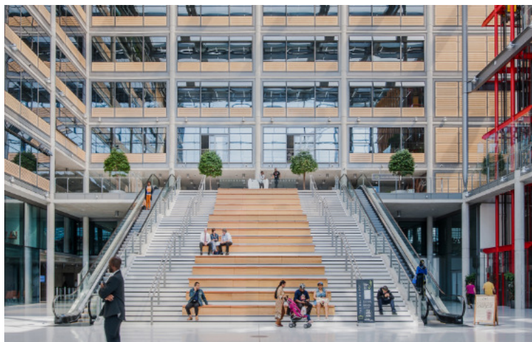
Brent Civic Centre

If any comments made by the Community Review Panel require clarification, it is the responsibility of the presenting team, whether project promoters or Brent Council officers, to draw this to the attention of the panel chair (if during the meeting) or the panel manager at Frame Projects (if the report of the meeting requires clarification).