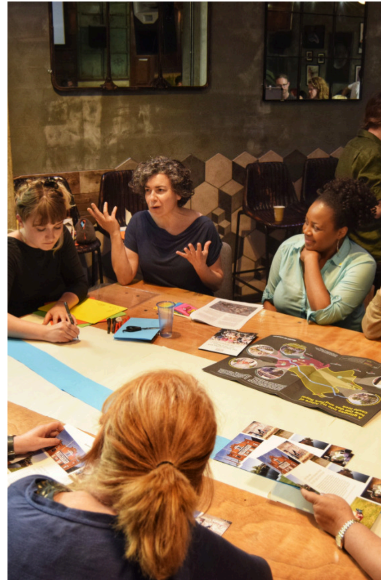
OPDC Community Engagement