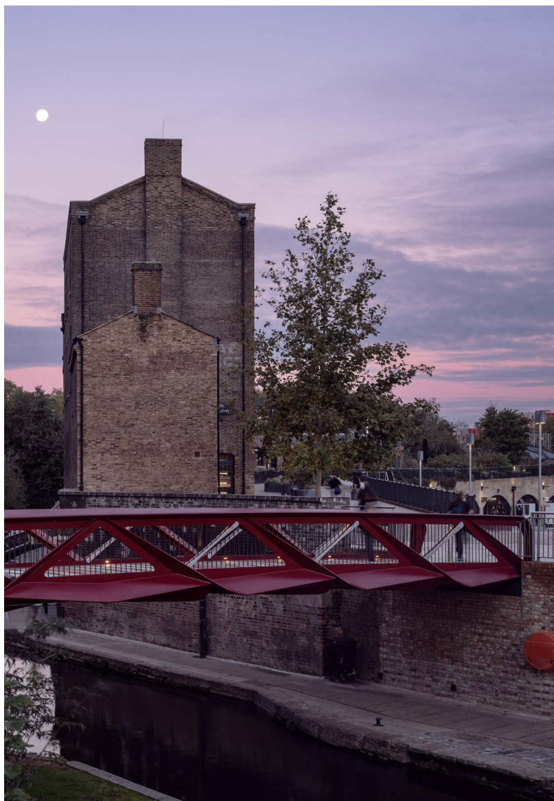
Esperance Bridge, King's Cross, Moxon Architects