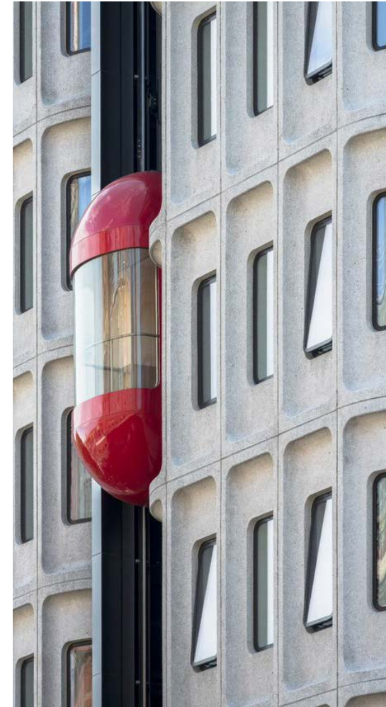
The Standard, ORMS RIBA National Award 2021 / Civic Trust Award 2021

The panel will not duplicate or replace existing mechanisms for securing high quality design. It is intended to provide additional expert advice to inform the planning process. By offering advice to applicants during the pre-application process and by commenting on planning applications, the panel will support Camden's planning officers and committee in securing high quality development.