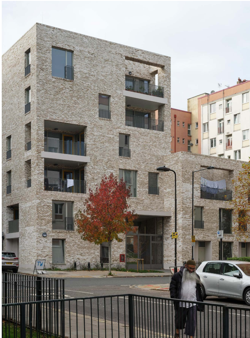
Caudale, Mæ Architects