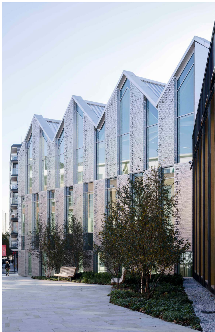
22 Handside Street, Coffey Architects