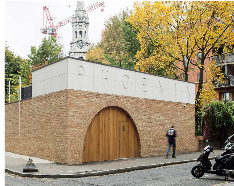
Phoenix Garden Community Centre, Office Sian Architecture + Design RIBA London Award 2021 / Camden Design Award 2022

As part of this annual review process, a meeting will be held with key Camden Council officers and the panel co-chairs to discuss the report and consider any recommendations for the following year.