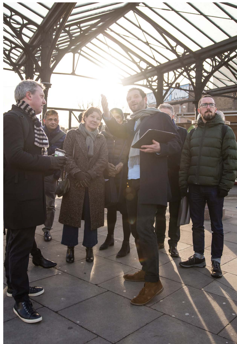
Camden Design Review Panel site visit

From time to time, it may be of benefit for specialist advice to be provided beyond the panel membership. In such cases, a professional with the relevant expertise may be invited to attend a review meeting, participating in the discussion with the status of an adviser to the panel.