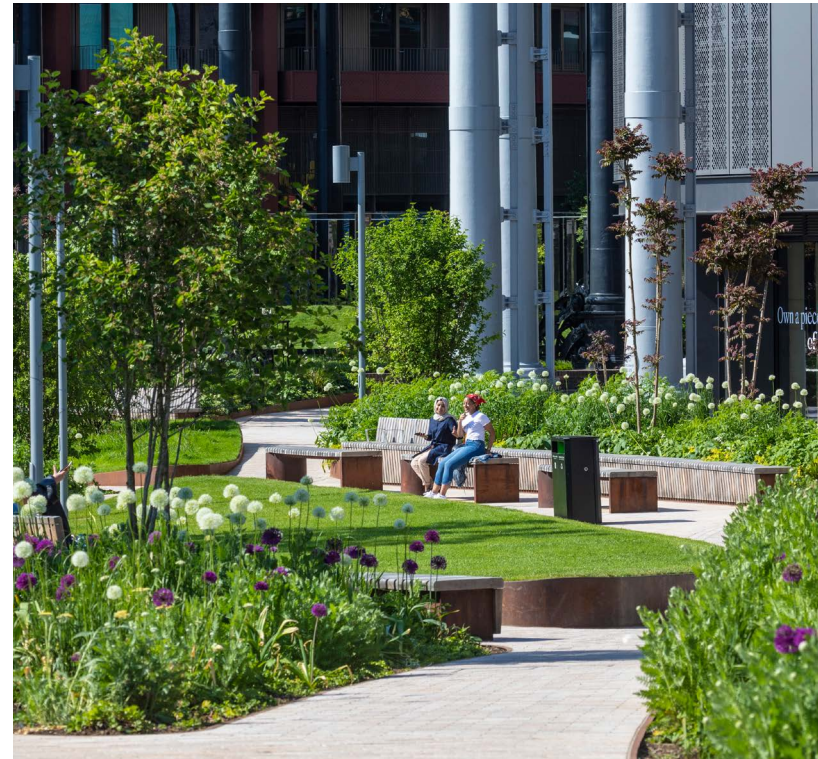
King's Cross Central, by Argent, Townshend Landscape Architects and Dan Pearson Studio © John Sturrock / Civic Trust Award 2019 / New London Architecture Award 2019

www.designcouncil.org.uk/resources/guide/design-review-principles-and-practice