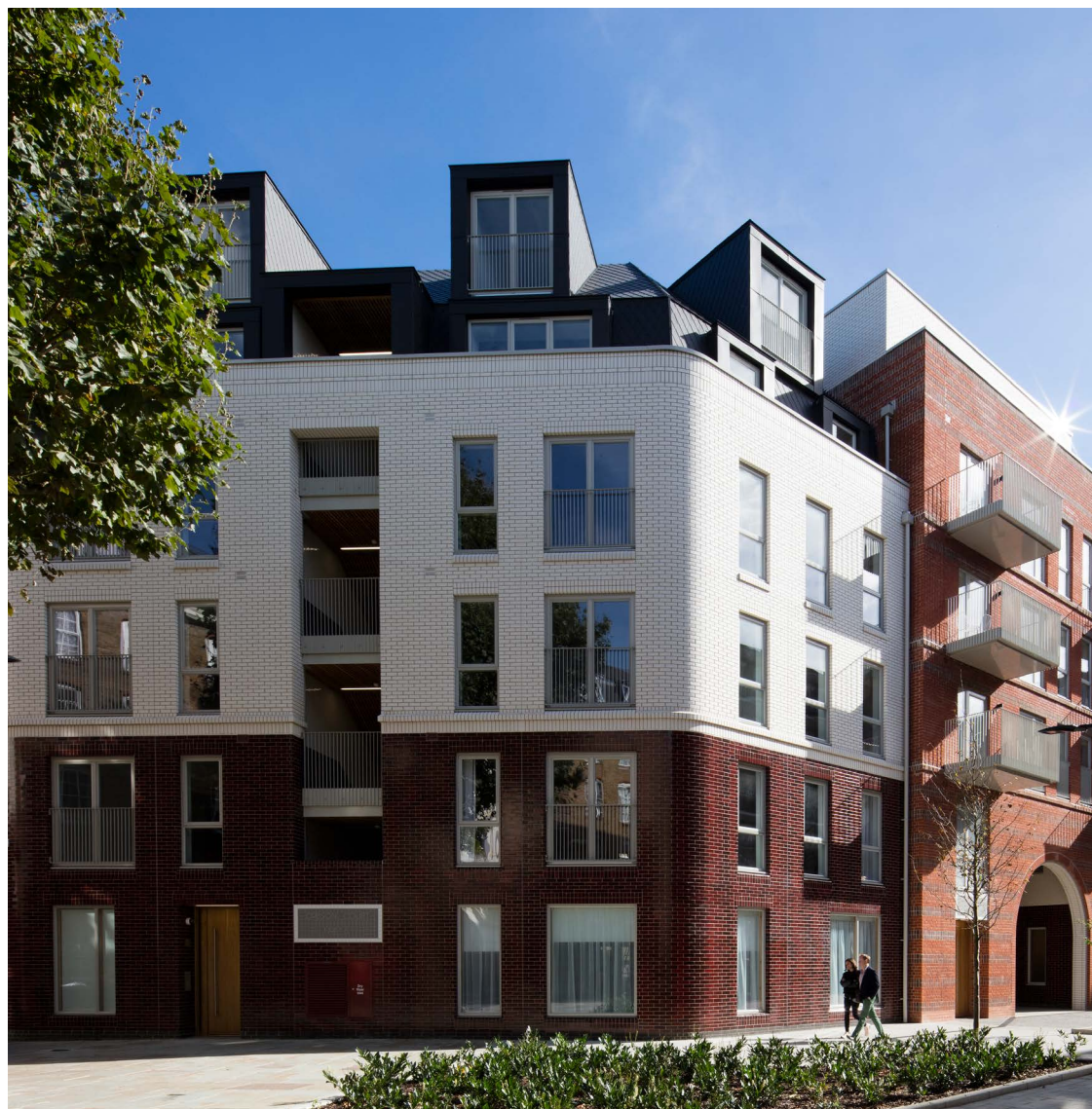
Bourne Estate, Matthew Lloyd Architects for Camden Council / Overall Winner – Housing Design Awards 2018 RIBA Award 2018 – London Region / New London Architecture Award 2018 / Camden Design Award 2017

A surgery review will be summarised in a brief document no more than two sides of A4, rather than a full report.