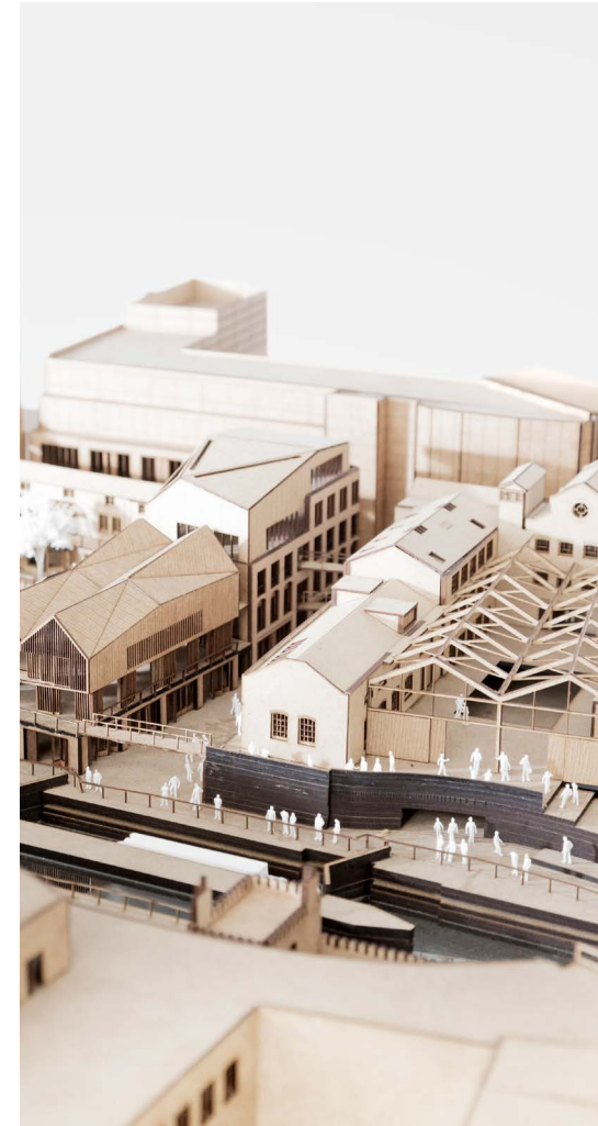
Plans for Camden Lock Market, Piercy & Company

https://www.london.gov.uk/sites/default/files/ggbd_london_design_review_charter_jan22.pdf