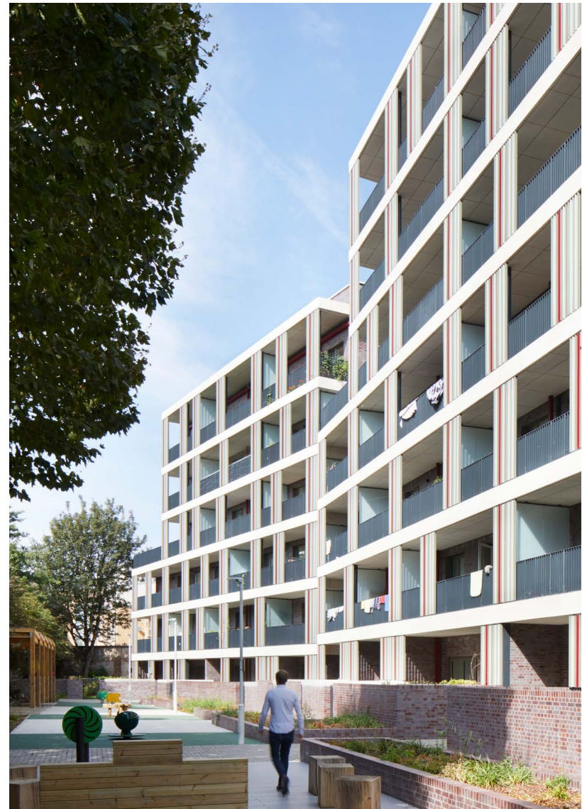
Agar Grove, for London Borough of Camden by Hawkins\Brown NLA Awards 2019 Sustainability Prize and Overall Winner