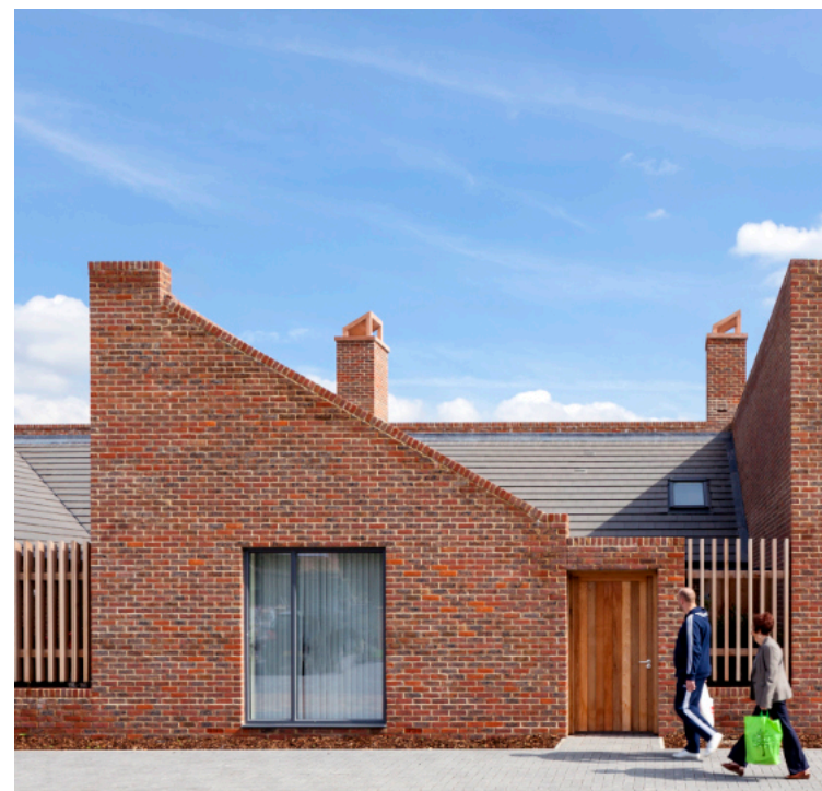
Courtyard Housing for Be First, Patel Taylor, Sunday Times British Home Awards 2015

As a public authority, the London Borough of Barking and Dagenham is subject to the Freedom of Information Act 2000 (the Act). All requests made to the borough for information with regard to the Quality Review Panel will be handled according to the provisions of the Act. Legal advice may be required on a case by case basis to establish whether any exemptions apply under the Act.