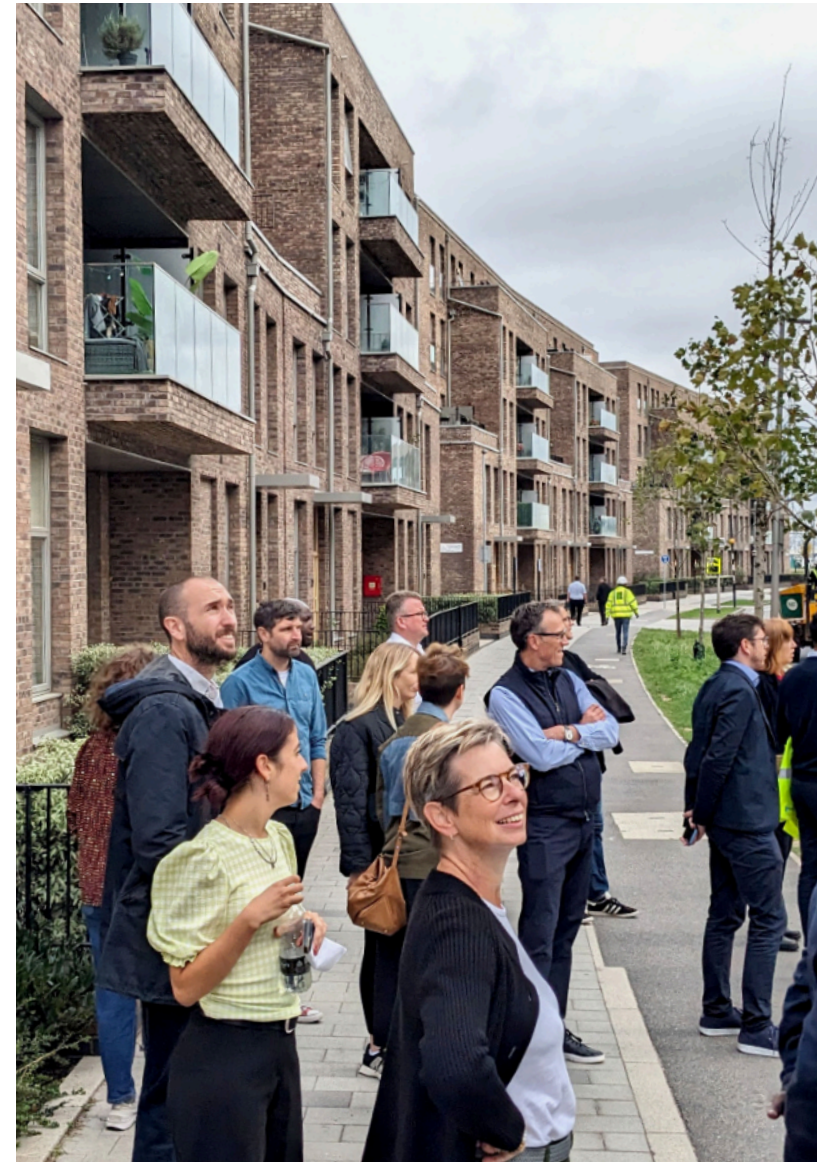
Barking Riverside site visit

From time to time, it may be of benefit for specialist advice to be provided beyond the panel membership. In such cases, a professional with the relevant expertise may be invited to attend a meeting, with the status of an adviser to the panel.