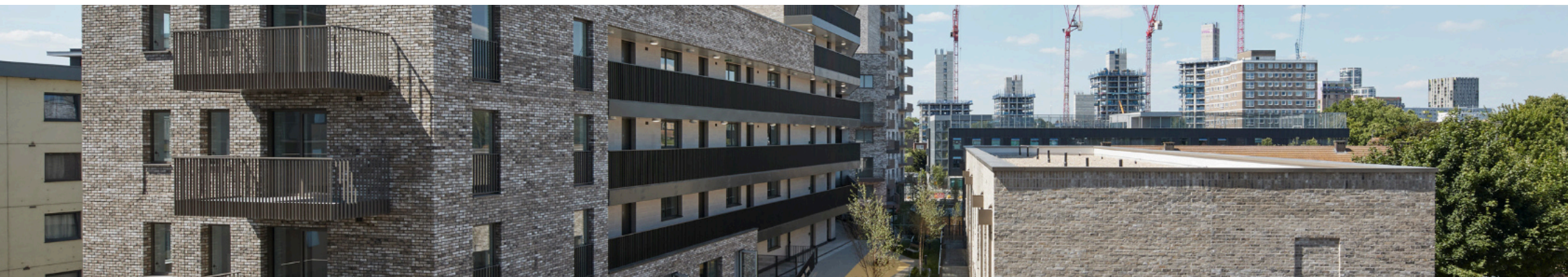
Gascoigne West Phase 1, White Arkitekter

Design Review: Principles and Practice Design Council CABE / Landscape Institute / RTPI / RIBA (2013)