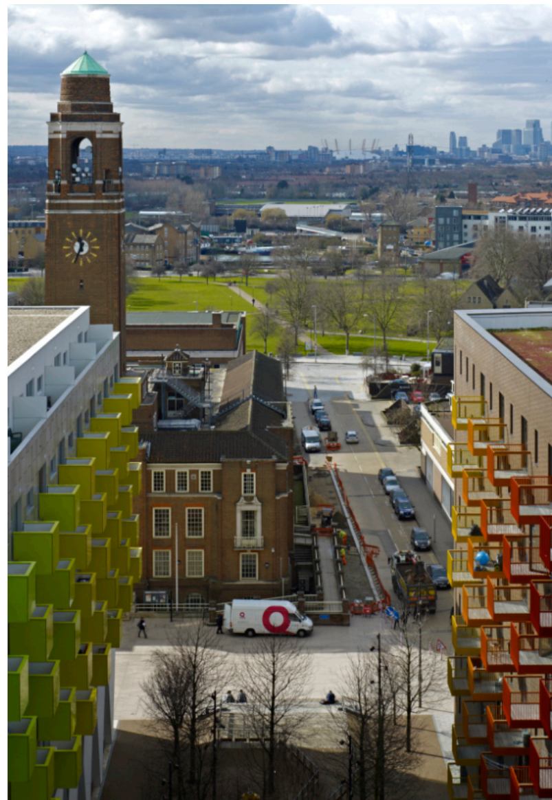
Barking Central RIBA Award for Architecture 2011 / New London Award Joint Overall Winner 2011 London Planning Awards - Best New Public Space 2010