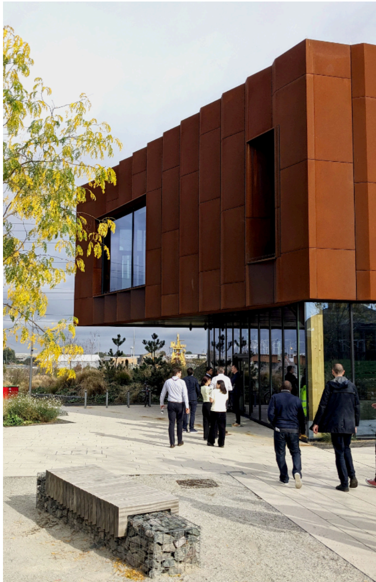
The Wilds Ecology Centre, Jestico + Whiles