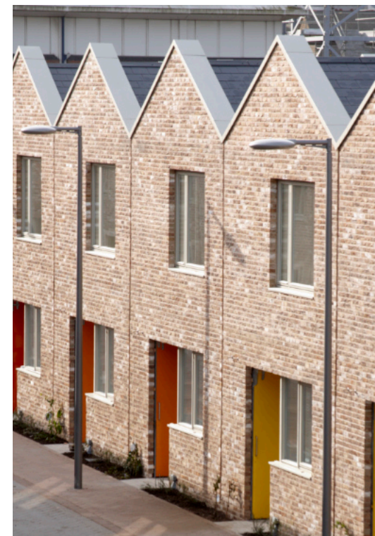
Anne Mews, Maccreeanor Lavington

This states that: “Local planning authorities should ensure that they have access to... design advice and review arrangements... These are of most benefit if used as early as possible in the evolution of schemes, and are particularly important for significant projects such as large scale housing and mixed use developments.” (Para. 138, NPPF, 2023).