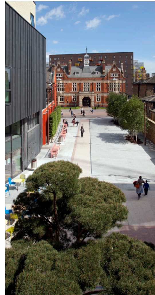
Short Blue Place

www.london.gov.uk/sites/default/files/ggbd_london_design_review_charter_jan22.pdf