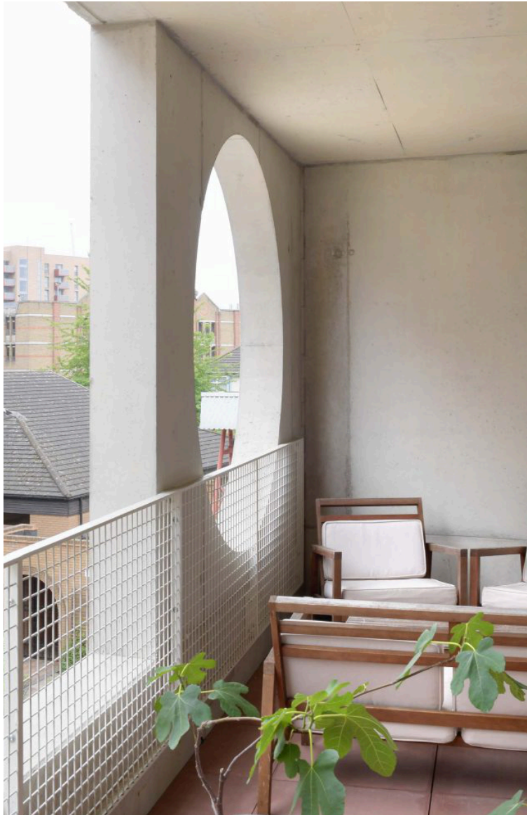
A House for Artists, Apparata