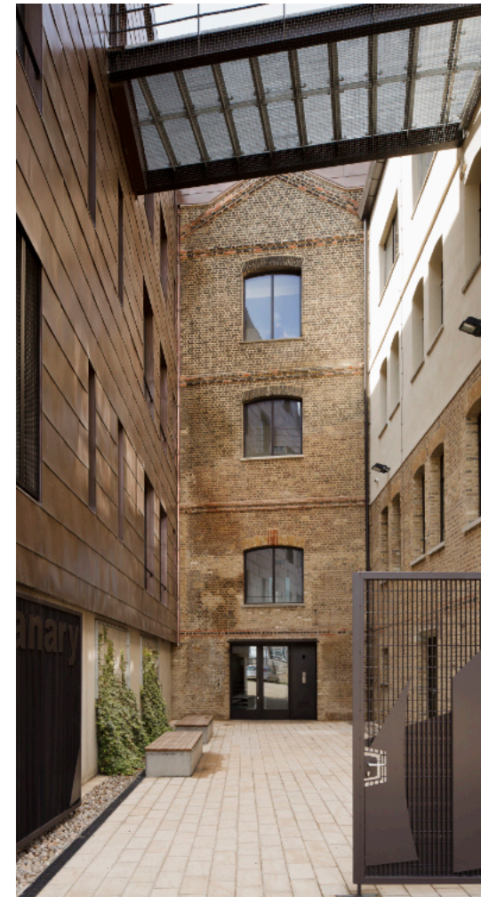
The Granary, Pollard Thomas Edwards

Large projects, for example schemes with several development plots, may be split into smaller elements for the purposes of review, to ensure that each component receives adequate time for discussion.