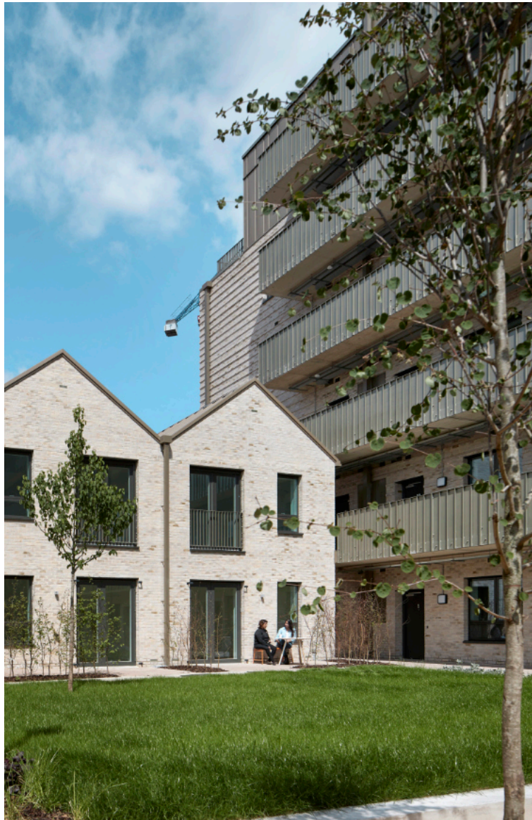
Gascoigne East Phase 2 , White Arkitekter © Paul Riddle © Paul Riddle