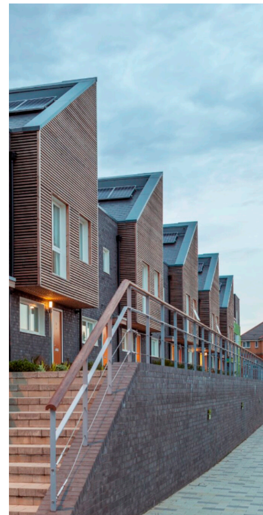
Barking Riverside / Sunday Times British Homes Awards 2013 - Development of the Year

As part of this annual review process, a meeting will be held with the planning authority and the panel chair to discuss the report and consider any recommendations for the following year.