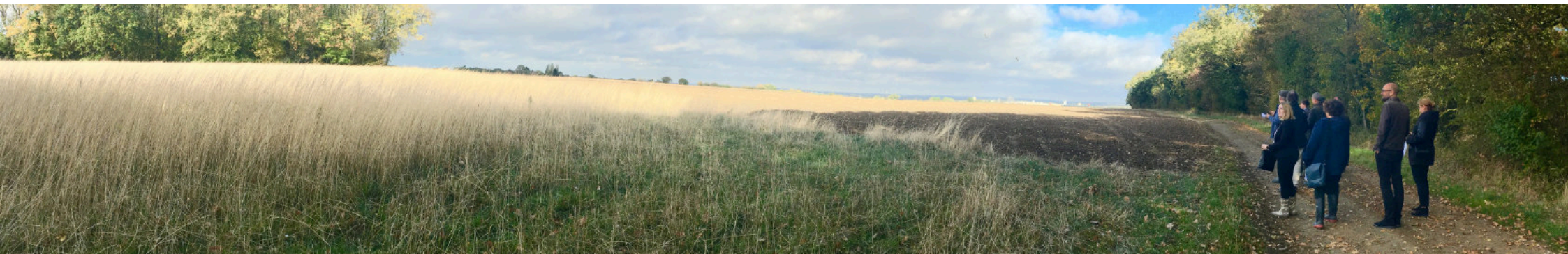
Panel site visit

Design Review: Principles and Practice Design Council CABE / Landscape Institute / RTPI / RIBA (2013)