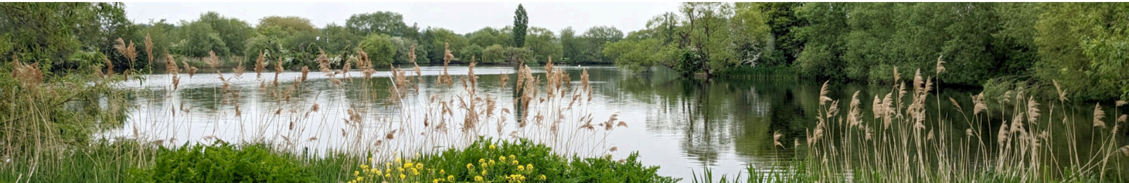
Roding Valley Lake

Large projects, for example schemes with several development plots, may be split into smaller elements for the purposes of review to ensure that each component receives adequate time for discussion.