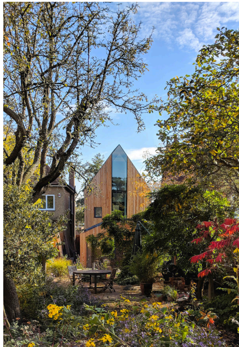
Epping Forest House © Studio McLeod