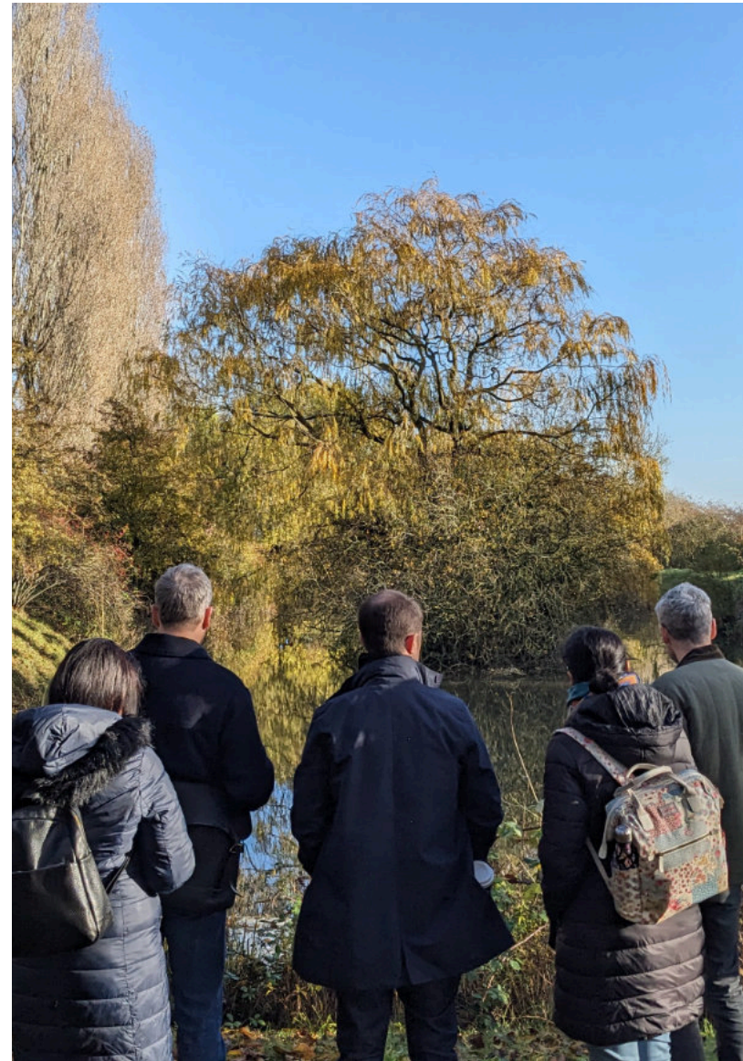
Site visit

In support of the District Council's commitment towards community engagement, there may also be potential, on occasion, to invite the chair of a community group to attend review meetings as an observer.