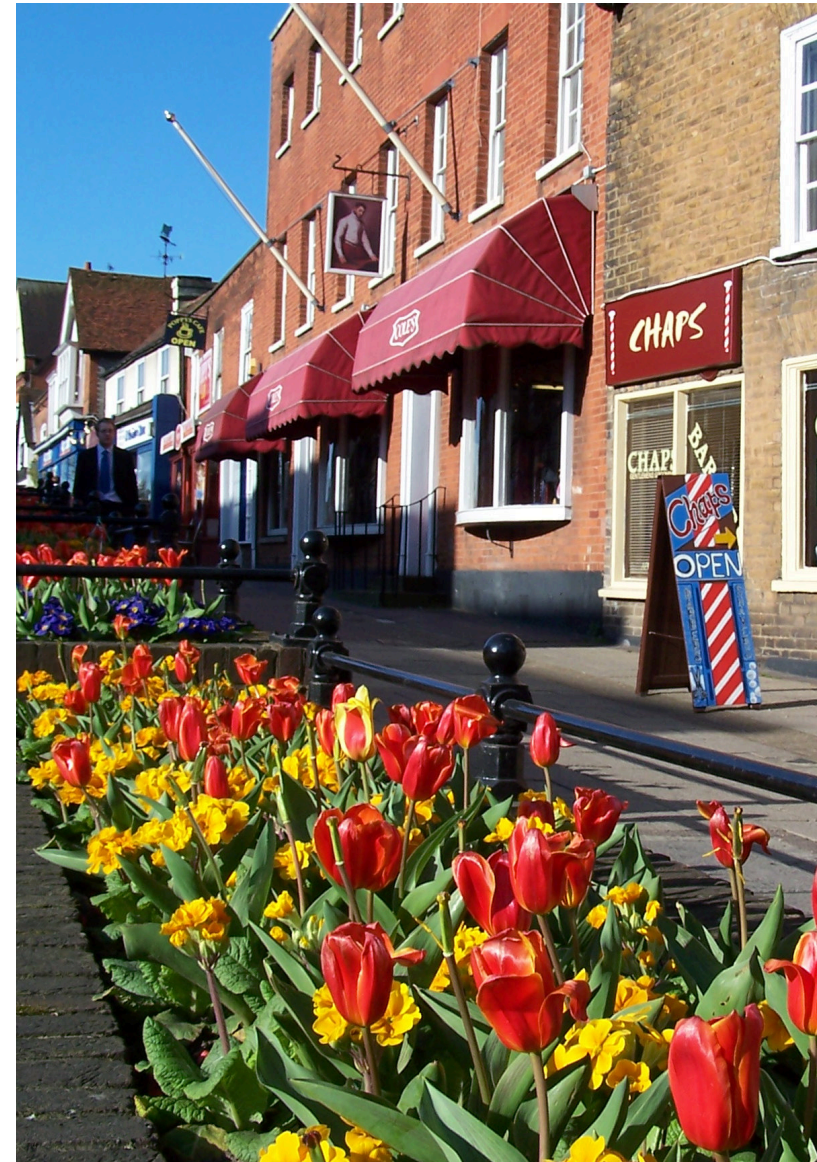
Epping High Street

www.designcouncil.org.uk/fileadmin/uploads/dc/Documents/Design%20Review_Principles%20and%20Practice_May2019.pdf