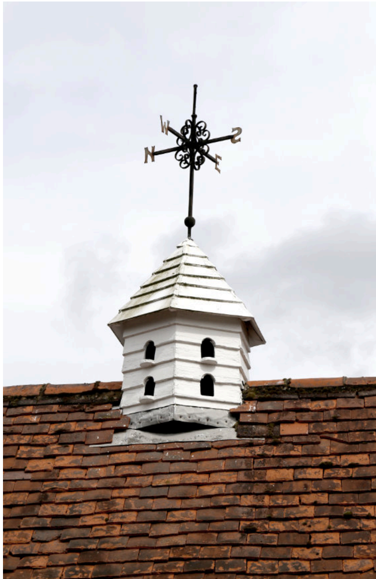
A pigeon cote on a cottage at Matching Tye, Essex