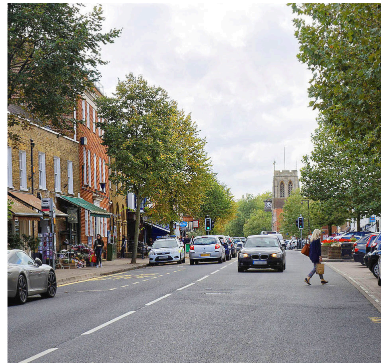
Epping High Street

As a public authority, the Epping Forest District Council is subject to the Freedom of Information Act 2000 (the Act). All requests made to the Council for information with regard to the Quality Review Panel will be handled according to the provisions of the Act. Legal advice may be required on a case by case basis to establish whether any exemptions apply under the Act.