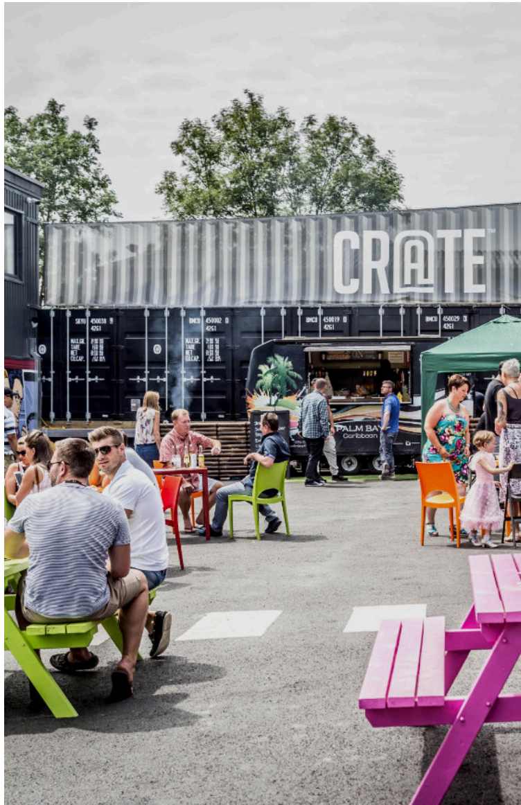
Crate Loughton