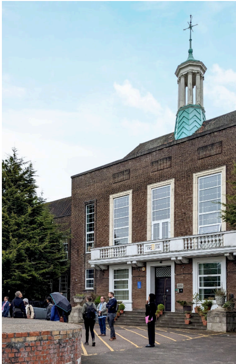
Guru Gobind Singh Khalsa College © Frame Projects