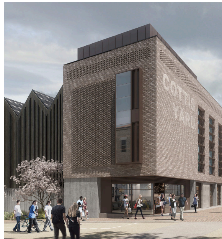
Cottis Yard

The Quality Review Panel process will require a broad range of expertise. The panel brings together leading practitioners across those disciplines that have a particular relevance to the area. The composition and remit of the panel reflects a review process that is multidisciplinary, collaborative and enabling.