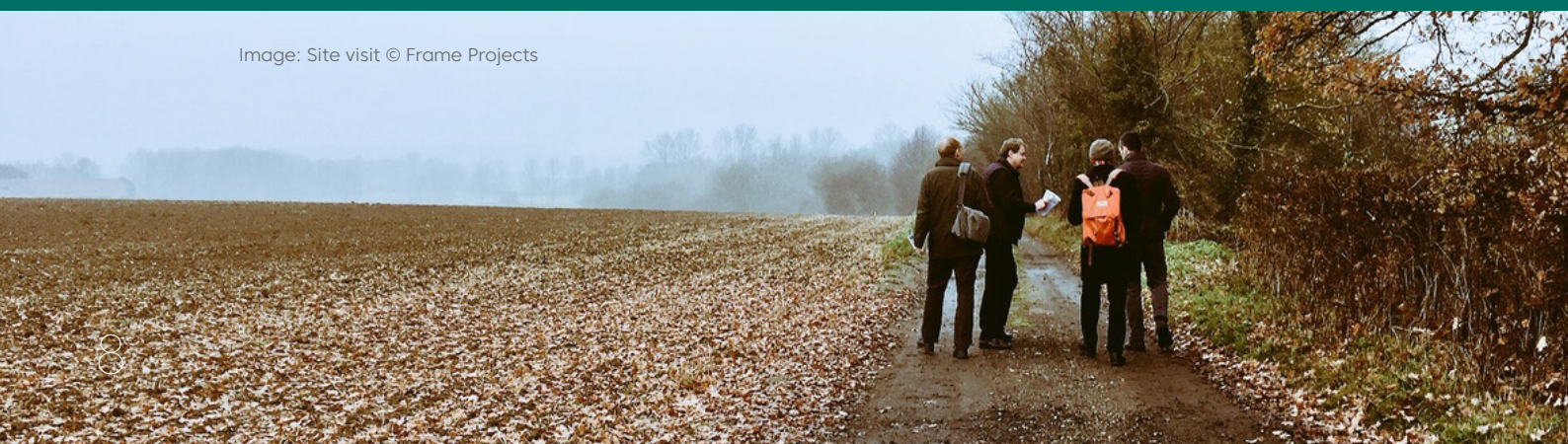
Image: Site visit

All local authority officers who responded to the questionnaire felt that they were clear about their role in the review process and found the panel's comments clear and constructive; half of the officers found the report helpful, while the other half found the panels advice helpful in supporting negotiations on design quality, and that the planning committee gave weight to the design review advice in the decision-making process. Some officers felt that the panel needed to better understand the Council's priorities.