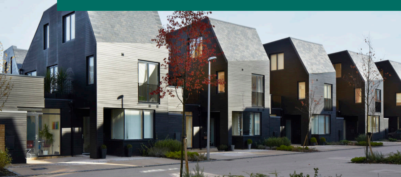
Image: Newhall Be by Alison Brooks Architects