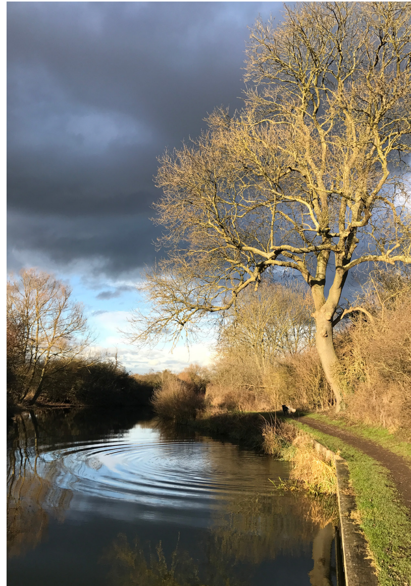
River Stort