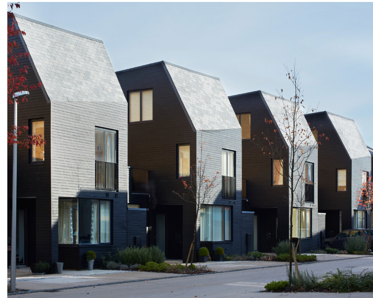
Newhall Be, Harlow, Alison Brooks Architects RIBA National Award 2013 - Housing Design Awards 2013

As public authorities the Councils are subject to the Freedom of Information Act 2000 (the Act). All requests made to the Councils (Harlow Council, Epping Forest District Council and East Herts District Council) for information with regard to the Harlow and Gilston Quality Review Panel will be handled according to the provisions of the Act. Legal advice may be required on a case by case basis to establish whether any exemptions apply under the Act.