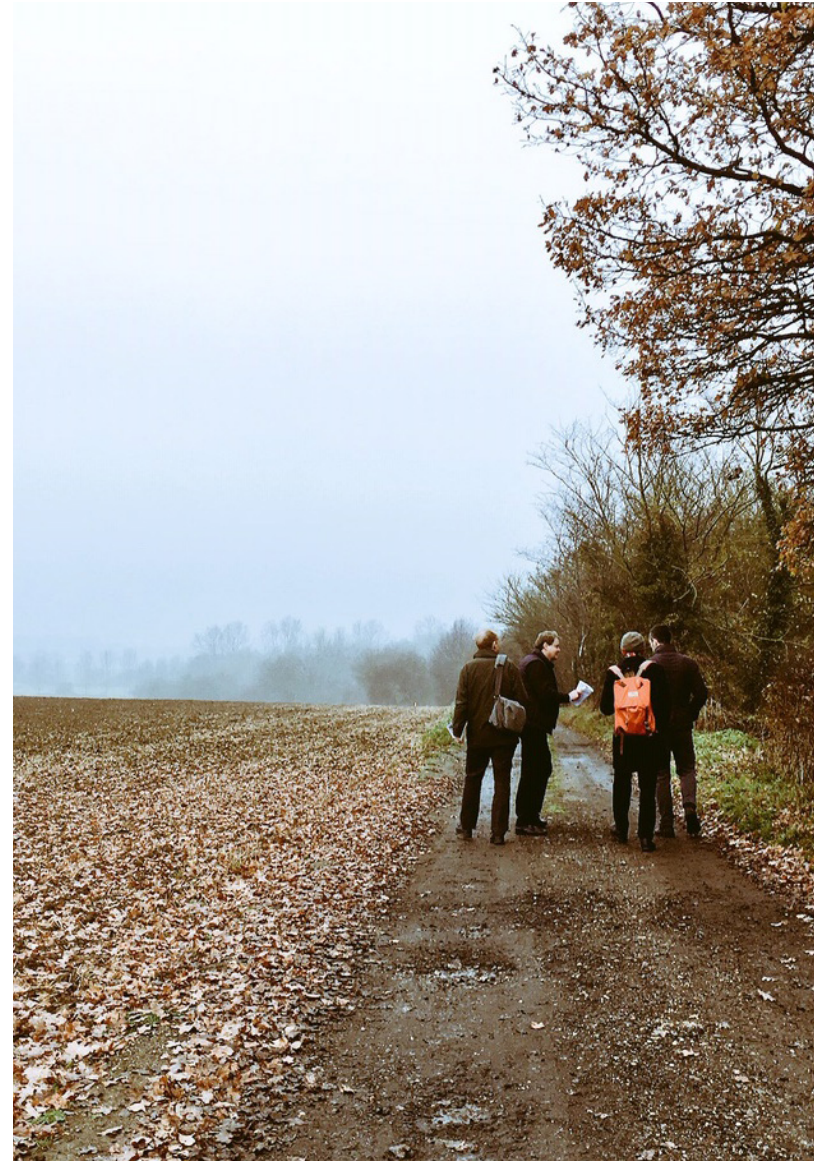
Panel site visit

From time to time, it may be of benefit for specialist advice to be provided beyond the Quality Review Panel membership. In such cases, a professional with the relevant expertise may be invited to attend a review meeting, participating in the discussion with the status of an adviser to the panel.