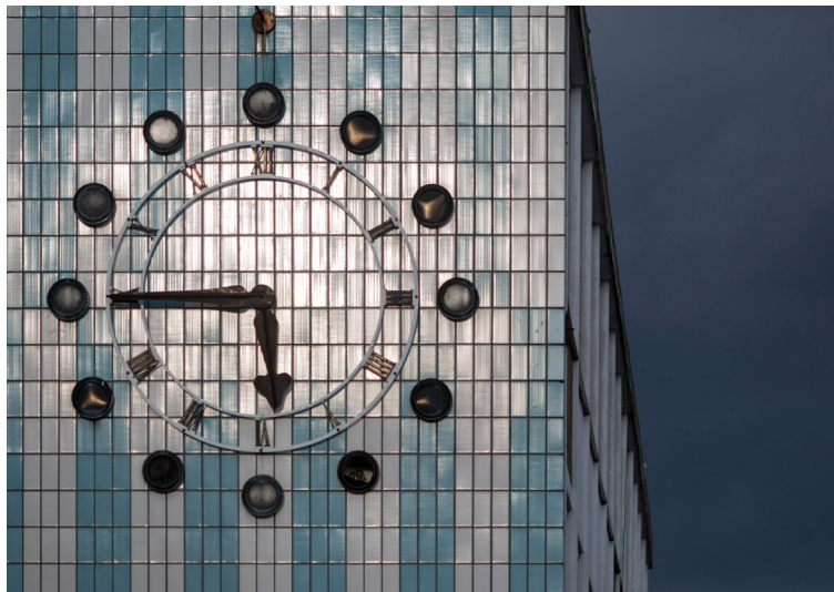
The Clock House

Because of the strategic design work required to bring forward the garden town, the Quality Review Panel's remit extends to advising the planning authorities on policy and design guidance documents, such as Supplementary Planning Documents (SPDs), and design codes. Panel members may also be called on to help facilitate community engagement on design of the garden town.