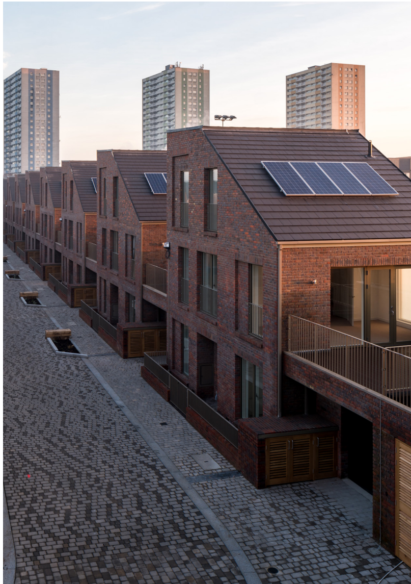
Dujardin Mews, Maccreanor Lavington and Karakusevic Carson Architects Civic Trust Award 2018 - RIBA National Award 2017