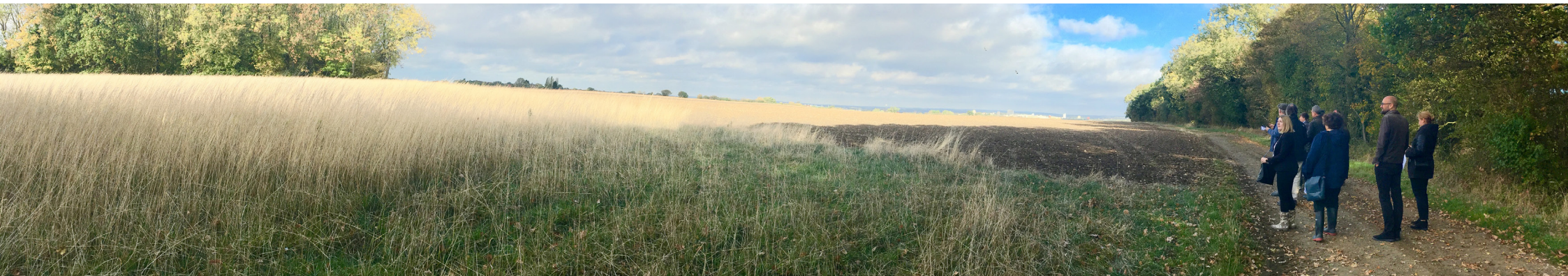
Panel site visit

Design Review: Principles and Practice Design Council CABE / Landscape Institute / RTPi / RIBA (2013)