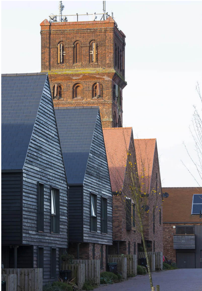
The Avenue, Saffron Walden, Pollard Thomas Edwards