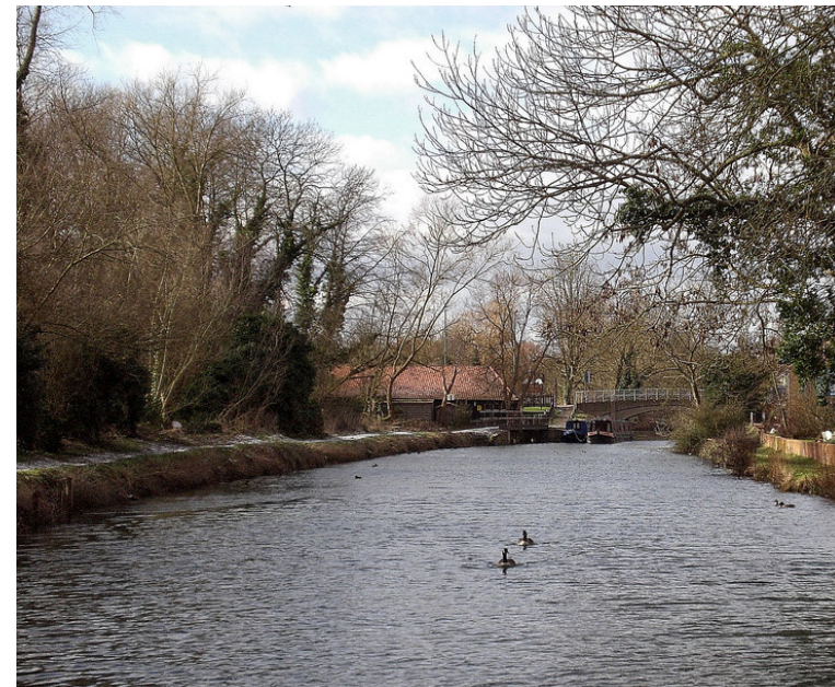
River Stort looking west towards the road bridge at Harlow Mill

As part of this annual review process, a meeting will be held with key Council officers and the panel chair to discuss the report and consider any recommendations for the following year.