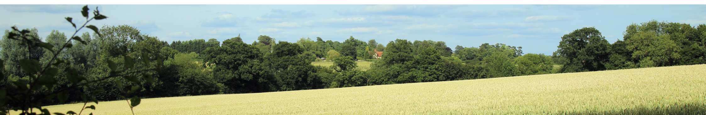
A view East from Gibberd Garden, Essex

Large projects, for example schemes with several development plots, may be split into smaller elements for the purposes of review to ensure that each component receives adequate time for discussion.