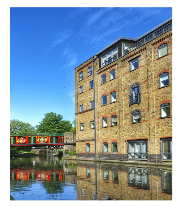
The Grand Union Canal

Training will be provided to equip the panel members with the skills required to understand and constructively input to the review meetings. Development sessions may take a variety of formats, beginning with a panel induction meeting, and with potential to provide training on other topics such as: sustainable design, landscape design or more practical topics such as how to read and interrogate architectural drawings. Topics will be identified with input from the panel members.