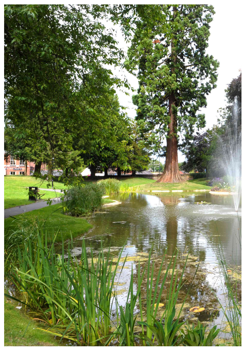
Tring Memorial Garden

Where a project returns for a second or subsequent review, the report of the previous review will be provided with the agenda.