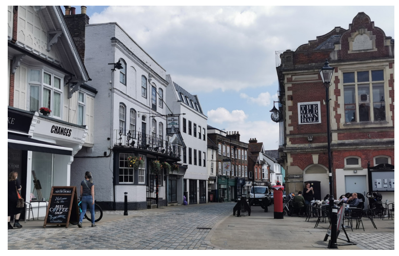
Old Town Hemel Hempstead

If any comments made by the Community Review Panel require clarification, it is the responsibility of the presenting team, whether project promoters or Dacorum officers, to draw this to the attention of the panel chair (if during the meeting) or the panel manager, Frame Projects (if the report of the meeting requires clarification).