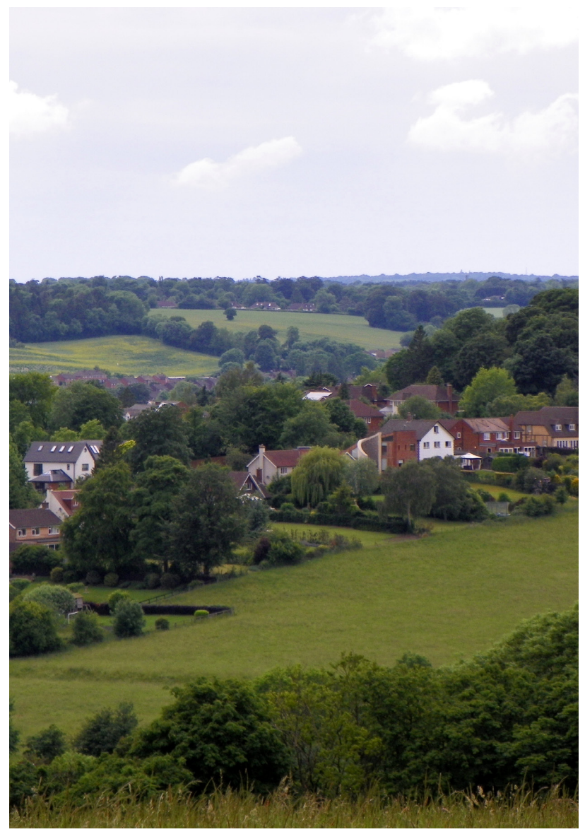
View of Berkhamsted

www.dacorum.gov.uk/docs/default-source/strategic-planning/hemelgarden-communities-charter.pdf?sfvrsn=2