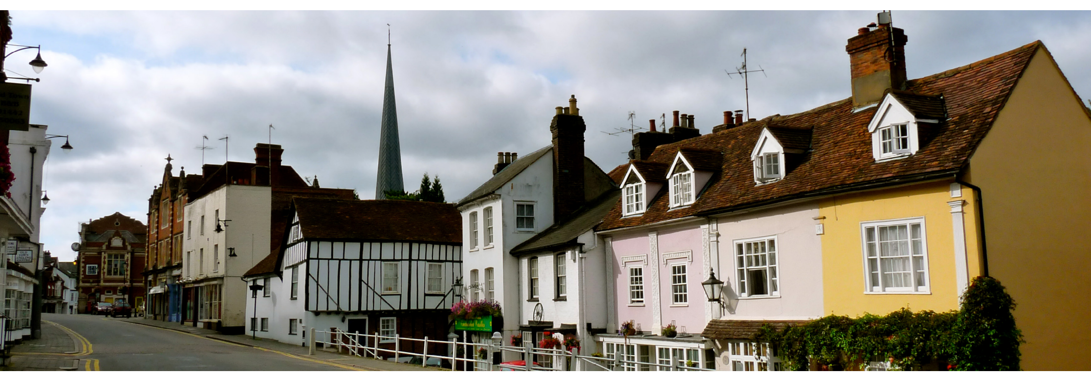
Hemel Hempstead Old Town

Community Review Panel members are entitled to claim reasonable expenses for travel to review meetings, and for other costs incurred in order to attend meetings. Frame Projects will provide an expense form which should be completed and sent to the Community Review Panel manager, with receipts or other evidence of expenditure, before the date of the next panel meeting.