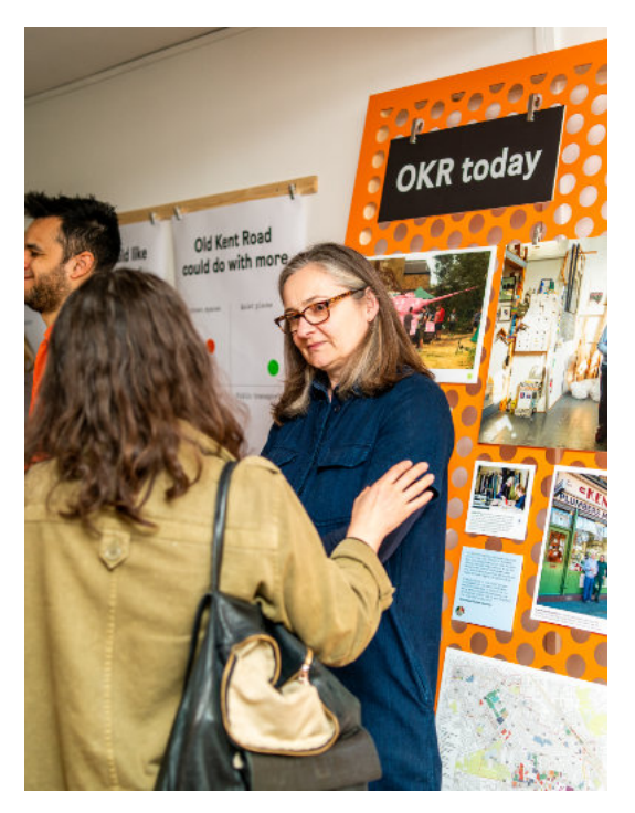
231 Old Kent Road opening

As with normal pre-application procedure, review advice given before an application is submitted remains confidential, seen only by the applicant, the planning authority and any other stakeholder bodies that the council has involved in the project. This encourages applicants to share proposals openly and honestly with the Community Review Panel – and ensures that they receive the most useful advice.