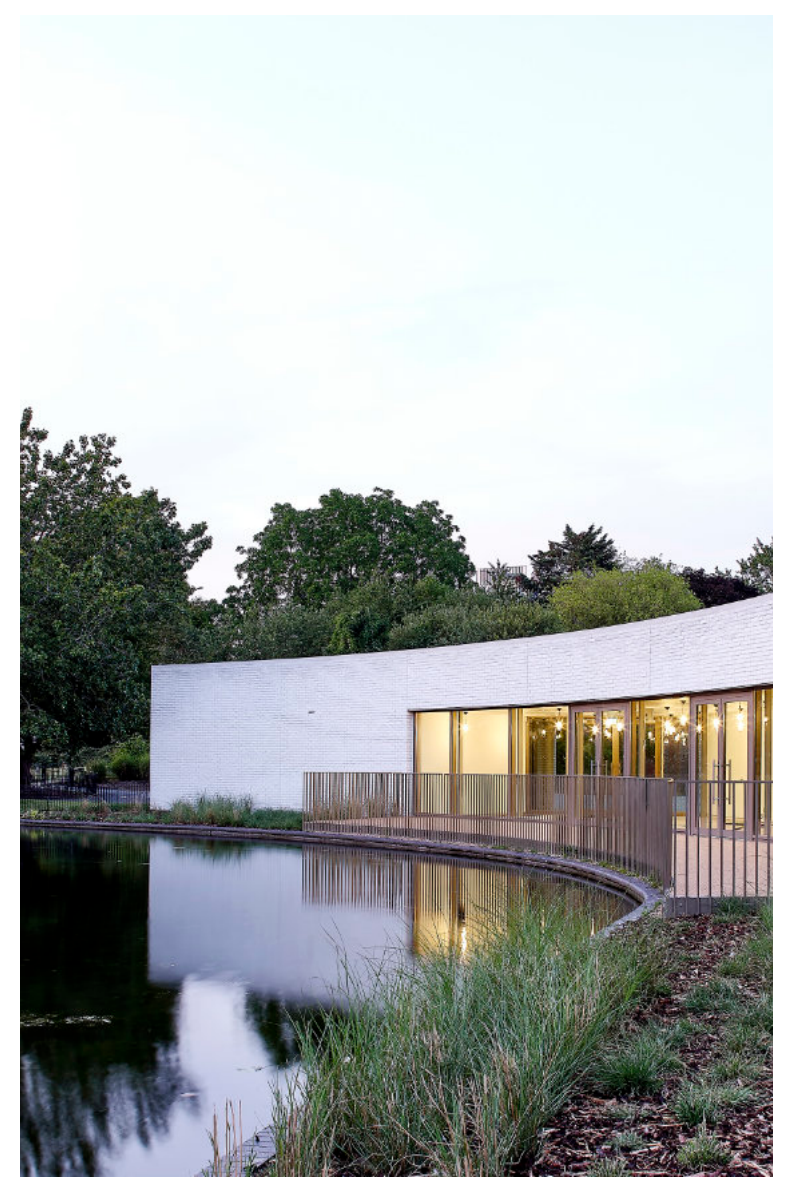
Southwark Park Pavilion, Bell Phillips Architects

www.london.gov.uk/sites/default/files/the_london_plan_2021.pdf