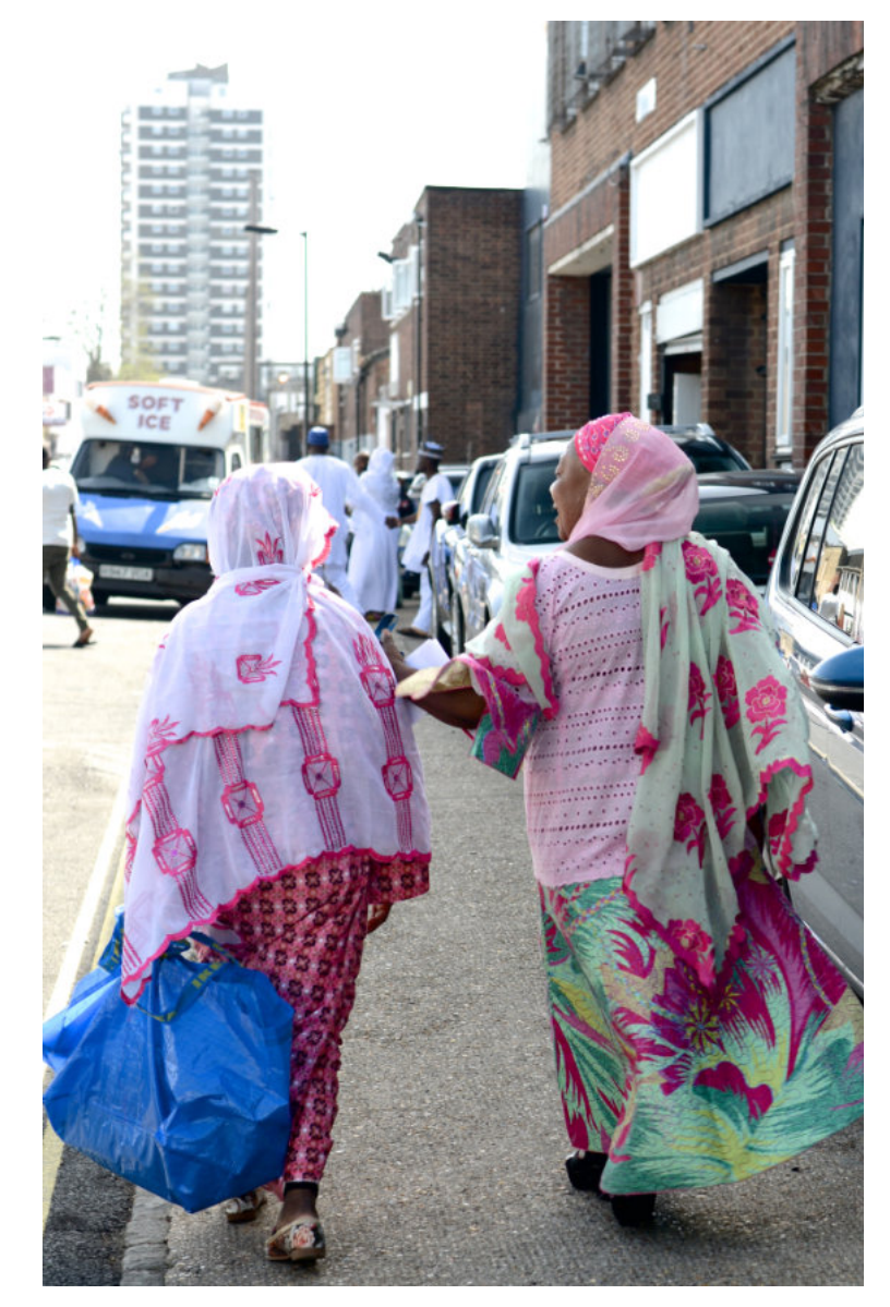
Ormside Street

Where a project returns for a second or subsequent review, the report of the previous review will be provided with the agenda.