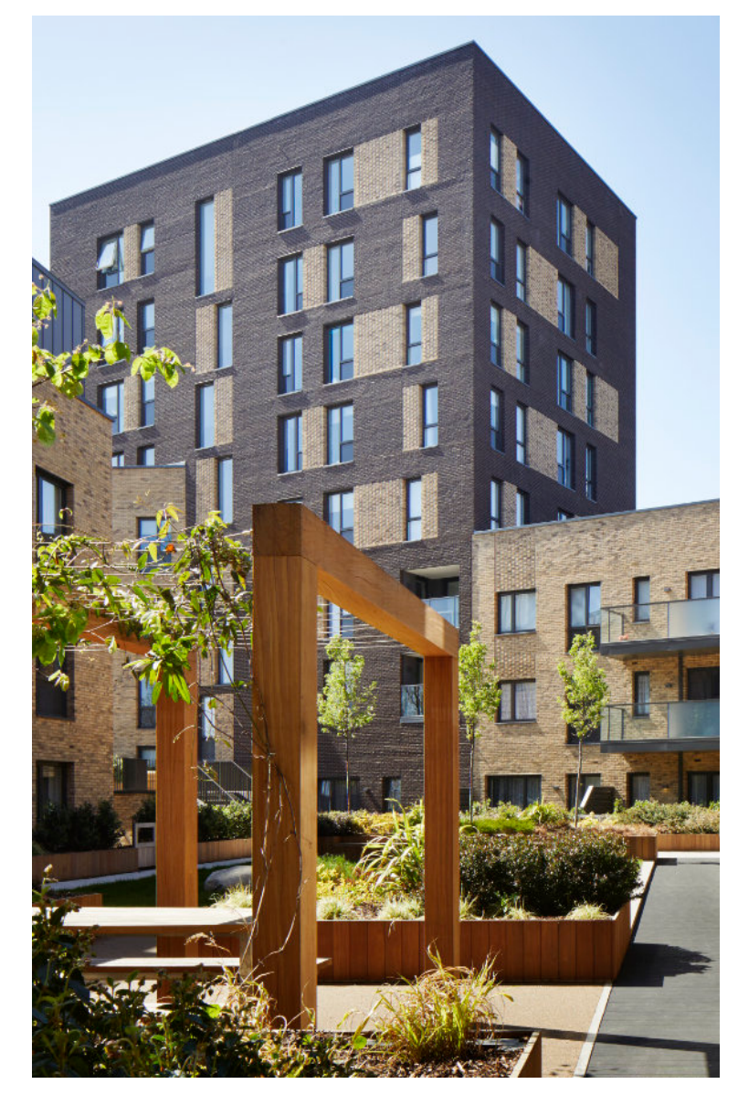
Peckham Place, Jestico + Whiles