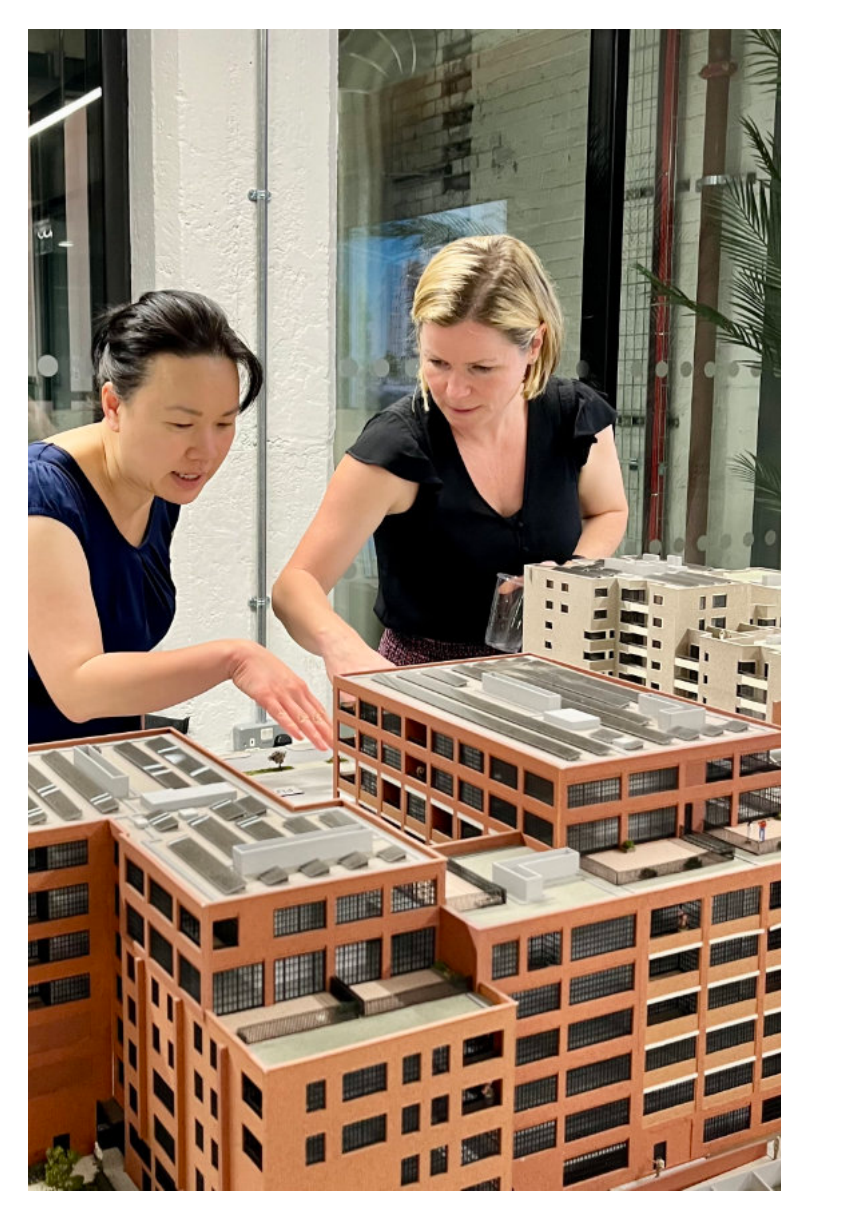
Community Review Panel meeting

If you would like a summary of this Handbook in your language, please contact Frame Projects.