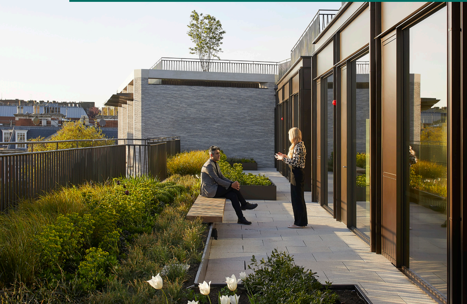
Image: The Kensington Building © Pilbrow and Partners, Hufton + Crow