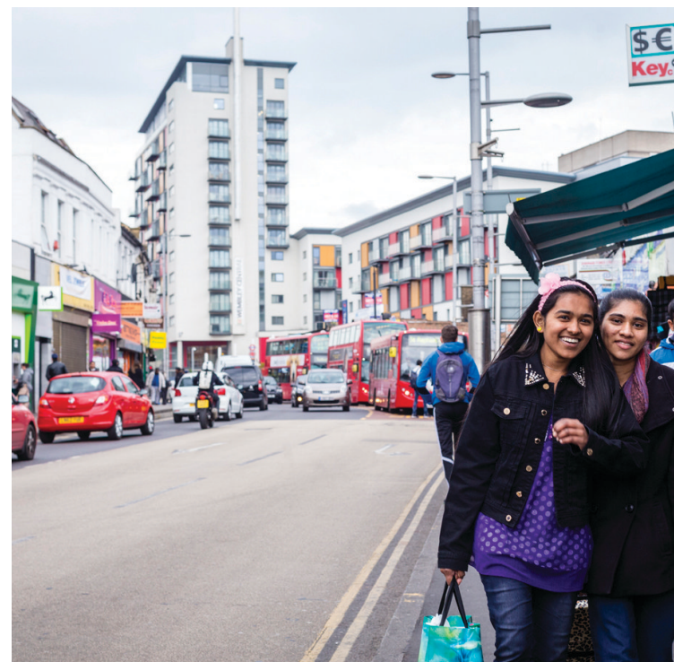
Wembley High Road

As a public authority, Brent Council is subject to the Freedom of Information Act 2000 (the Act). All requests made to Brent Council information with regard to the Brent Community Review Panel will be handled according to the provisions of the Act. Legal advice may be required on a case-by-case basis to establish whether any exemptions apply under the Act.