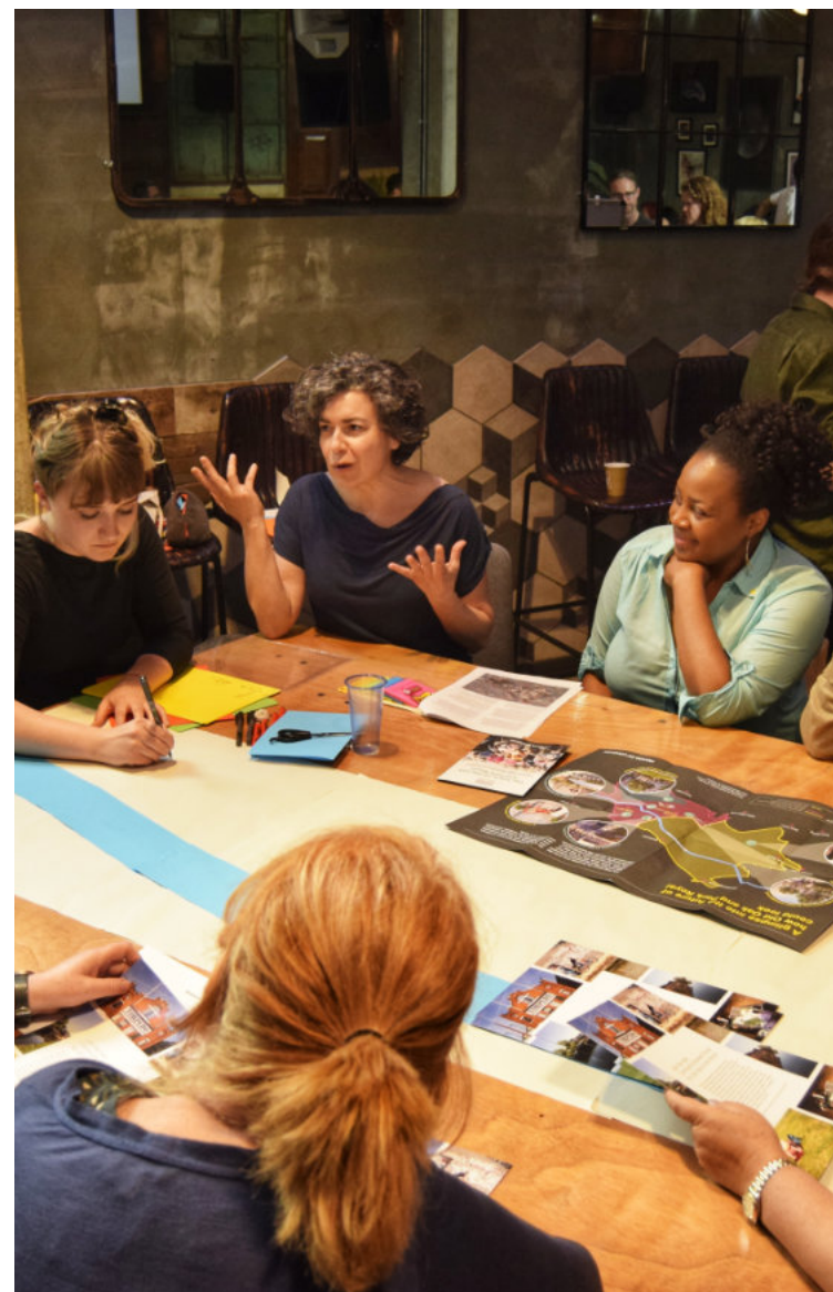
Community Engagement