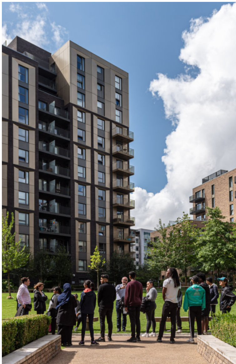
Seen and Heard Workshop, London Borough of Culture 2020