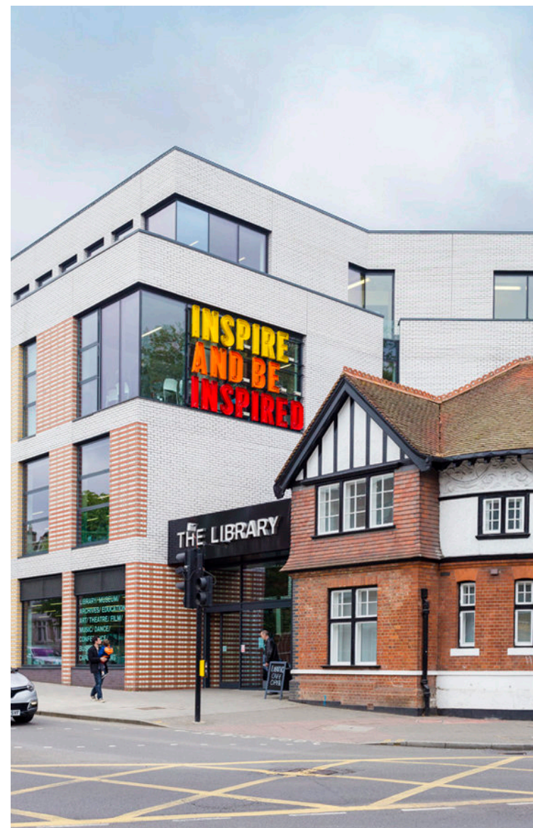
The Library at Willesden Green, AHMM

If any comments made by the Community Review Panel require clarification, it is the responsibility of the presenting team, whether project promoters or Brent Council officers, to draw this to the attention of the panel chair (if during the meeting) or the panel manager at Frame Projects (if the report of the meeting requires clarification).