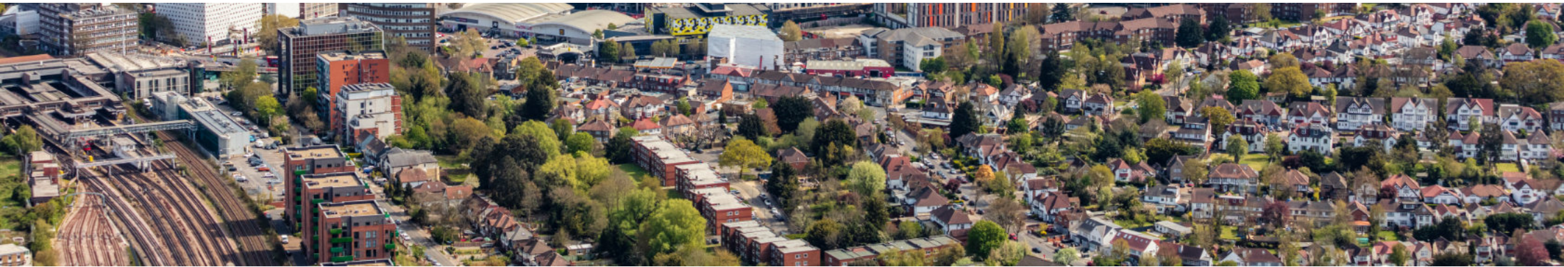
Wembley Park

www.london.gov.uk/sites/default/files/good_growth_web.pdf