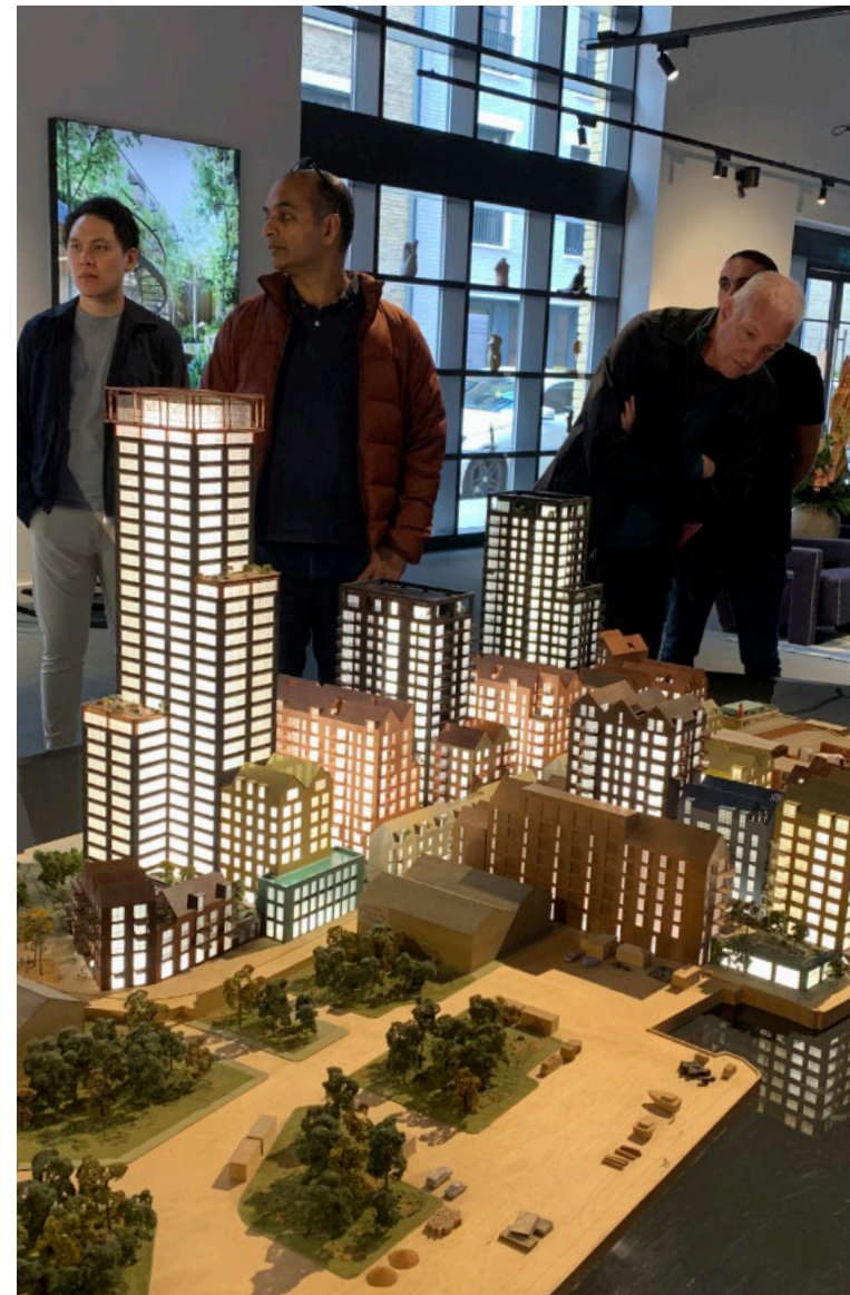
Community review meeting

Where a project returns for a second or subsequent review, the report of the previous review will be provided with the agenda.