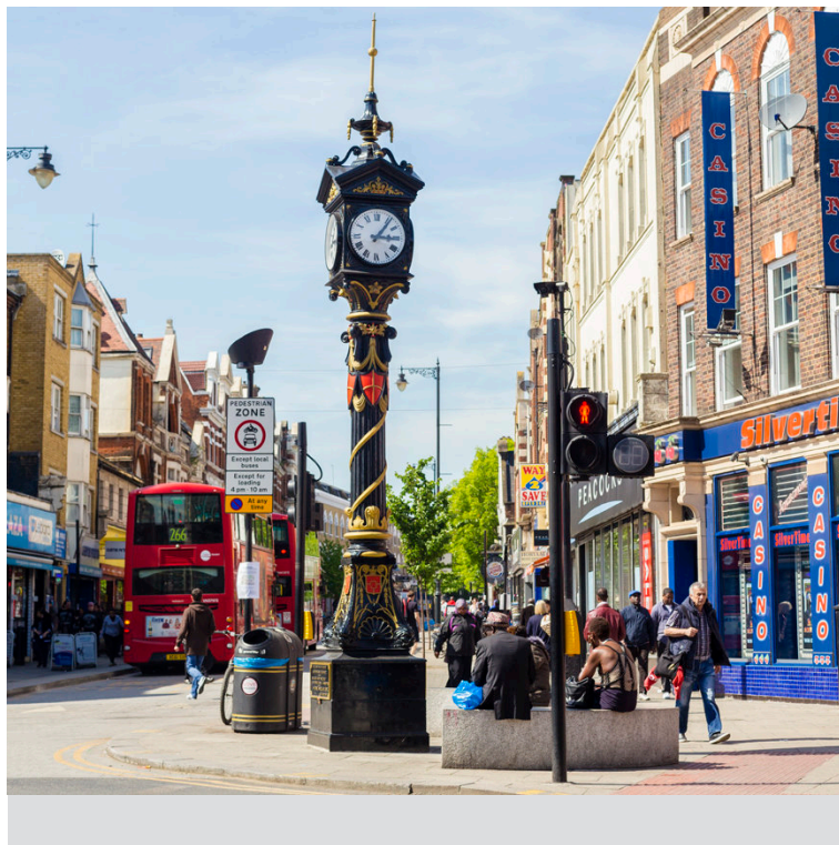
Harlesden High Street

Brent Community Review Panel members are entitled to claim reasonable expenses for travel to review meetings and site visits, and for other costs incurred in order to attend meetings. Frame Projects will provide an expense form which should be completed and sent to the Community Review Panel Manager with receipts or other evidence of expenditure, before the date of the next panel meeting.