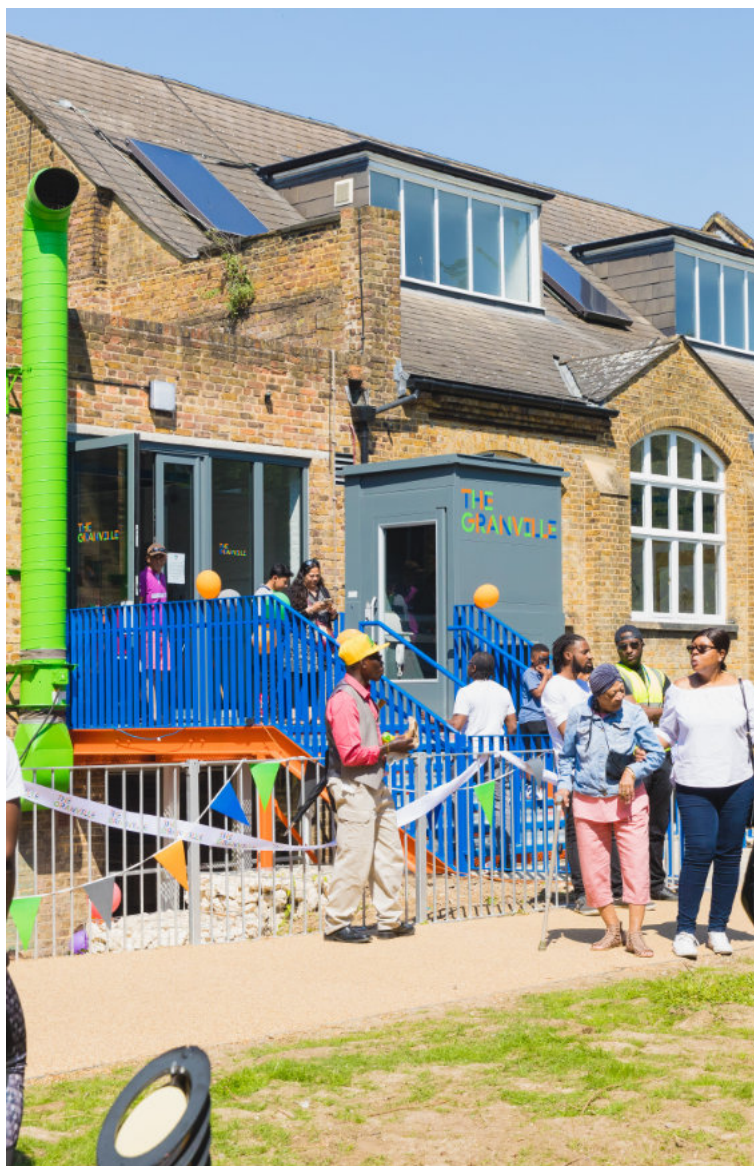
The Granville, RCKa