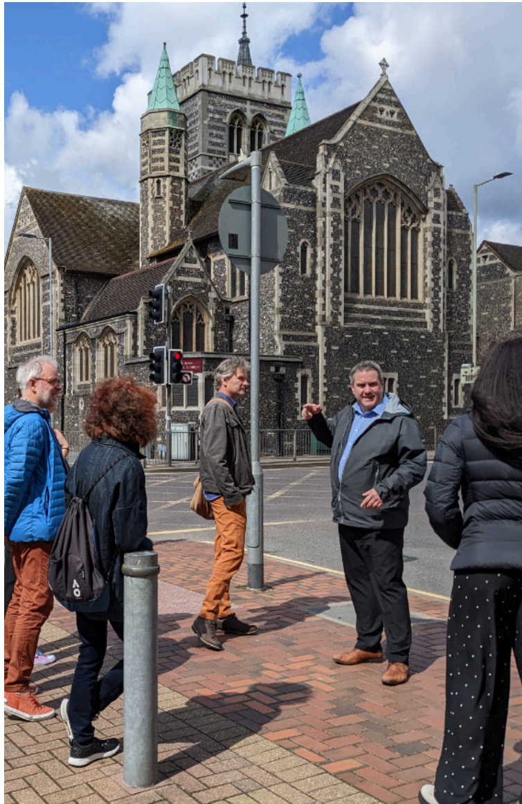
Watford Place Shaping Panel Site Visit © Frame Projects