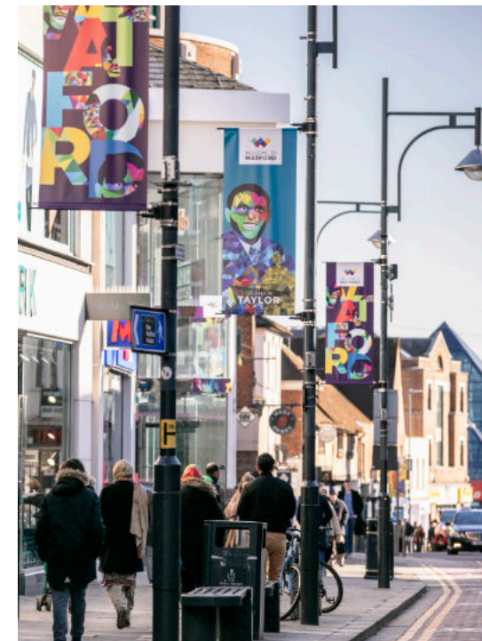
Watford High Street

process, in line with Section 12 of the NPPF. This states that: 'Local planning authorities should ensure that they have access to... design advice and review arrangements... These are of most benefit if used as early as possible in the evolution of schemes, and are particularly important for significant projects such as large scale housing and mixed use developments.' (Para. 138, NPPF, 2023).