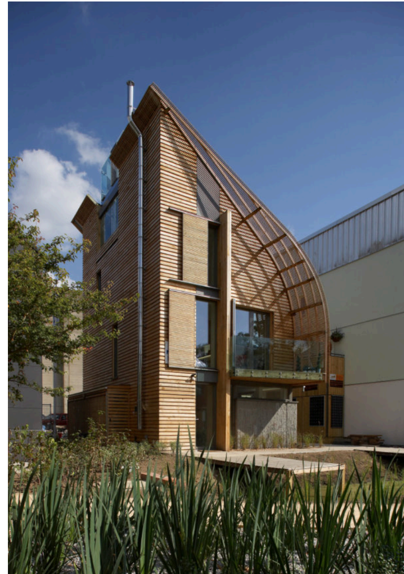
Lighthouse 2008 British Homes Award, 2008 RICS South East Award

From time to time, it may be of benefit for specialist advice to be provided beyond the Place Shaping Panel membership. In such cases, a professional with the relevant expertise may be invited to attend a review meeting, participating in the discussion with the status of an adviser to the panel.