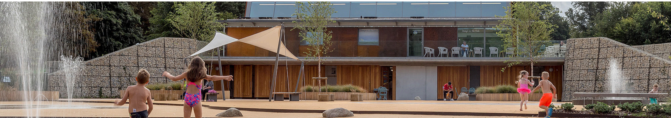
Cassiobury Park Hub © Knox Bhavan Architects for Watford Borough Council Building Futures Award 2018

Large projects, for example schemes with several development plots, may be split into smaller elements, to ensure that each component receives adequate time for discussion.