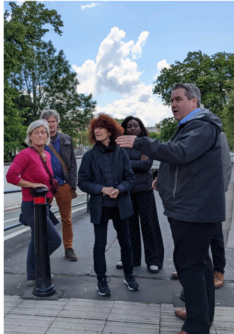
Watford Place Shaping Panel Site Visit

www.designcouncil.org.uk/fileadmin/uploads/dc/Documents/Design%20Review_Principles%2520and%2520Practice_May2019.pdf