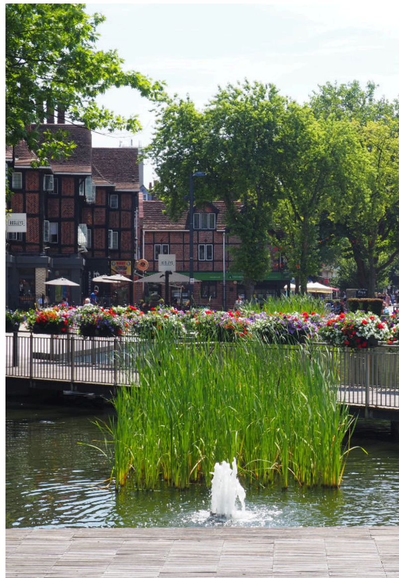
Watford High Street