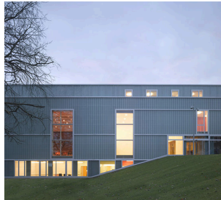
Watford Music Centre, Tim Ronalds Architects

As a public authority, the Watford Borough Council is subject to the Freedom of Information Act 2000 (the Act). All requests made to Watford Borough Council for information with regard to the Place Shaping Panel will be handled according to the provisions of the Act. Legal advice may be required on a case by case basis to establish whether any exemptions apply under the Act.