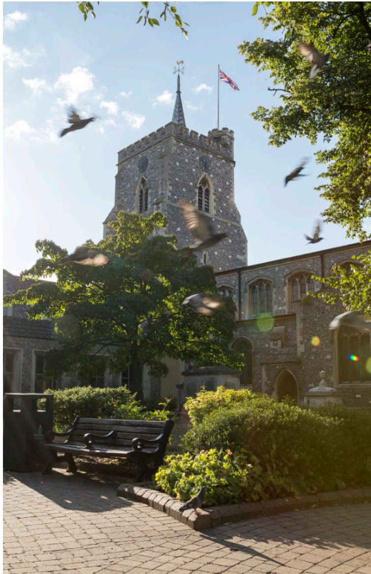
St Mary's Church, Watford