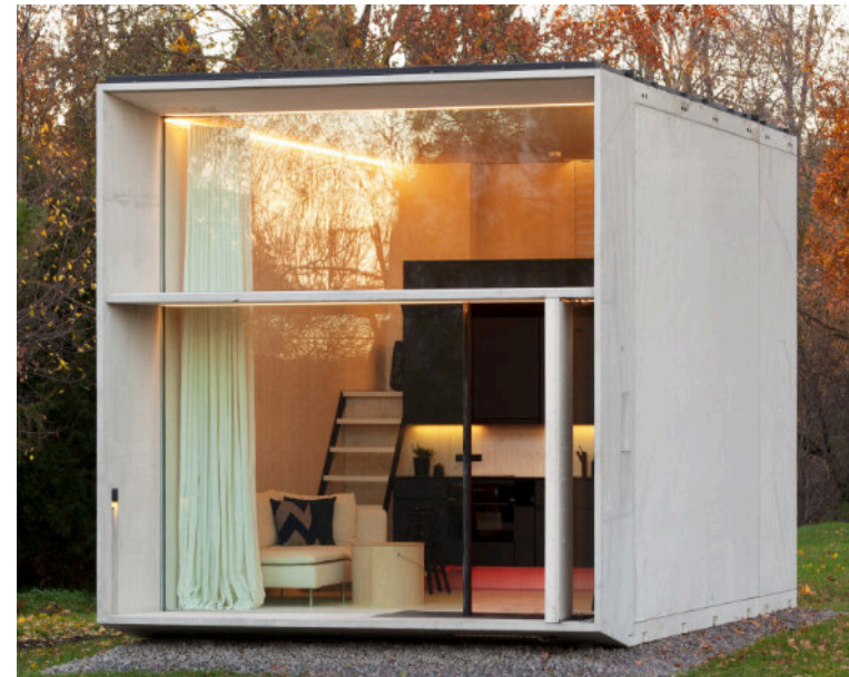
The Koda House, BRE Innovation Park, Watford

As part of this annual review process, a meeting will be held with key Watford Borough Council officers and the panel chair to discuss the report and consider any recommendations for the following year.