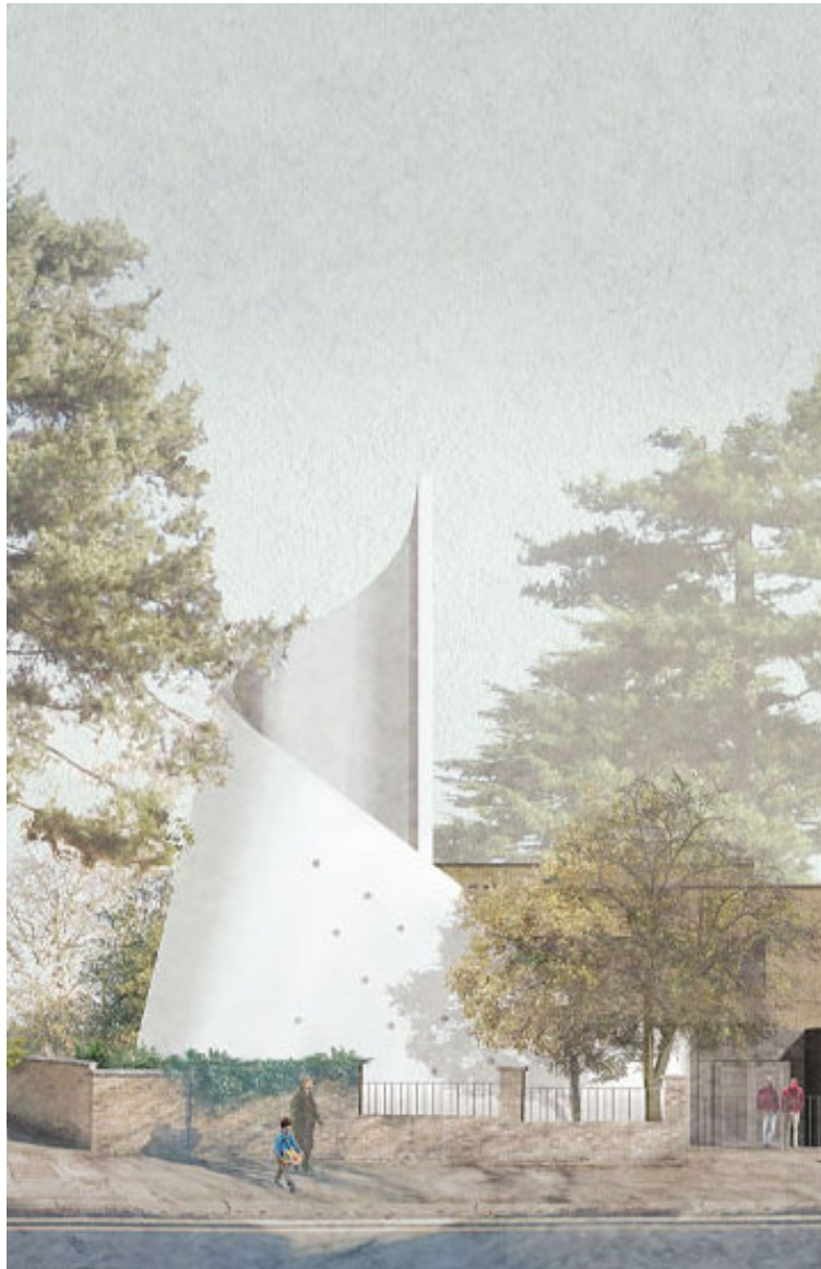
Scroll Church © Theis + Khan Architects