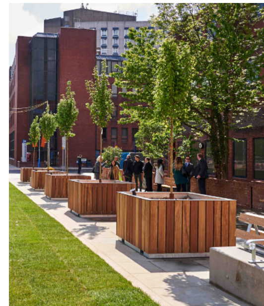
Clarendon Road Path

Any subsequent reviews will be charged for at the applicable rate (detailed in Section 14).